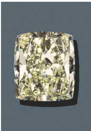
2071A An unmounted diamond 21.91 carats, Fancy Light Yellow / VVS2 Sold for CHF 144 000 / EUR 95 400