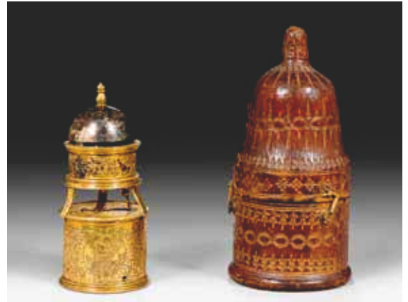
1006 Renaissance traveling clock with leather case Augsburg, 16th century Height 11.5 cm