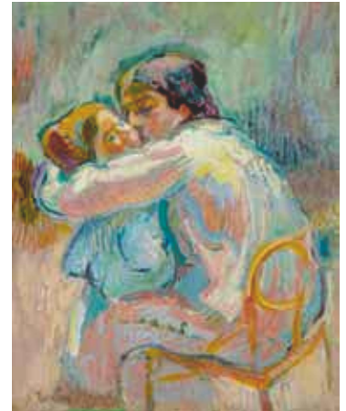
3219 Nicolas Tarkhoff "Maternité" Oil on canvas. 81 x 65 cm