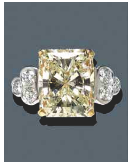
2162 A diamond ring Circa 14.2 carats, Fancy Light Yellow / VS2 flanked by 6 brilliant-cut diamonds totaling circa 1.4 carats, mounted in white gold.