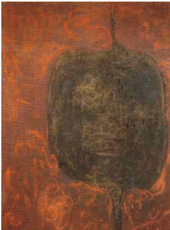
3279 Lucio Fontana "Concetto Spaziale." 1958 Oil on canvas. 167 x 120 cm

The fine art auctions at Koller on 19 June realized a total of CHF 6.2 million / EUR 4.15 million.