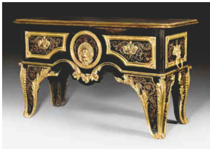
1083 "Bureau en commode," Paris, after 1723 by André-Charles Boulle and sons Ebony with engraved brass and tortoiseshell marquetry