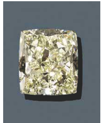
2071 An unmounted diamond 20.15 carats, Fancy Light Yellow / VVS2 Sold for CHF 144 000 / EUR 95 400