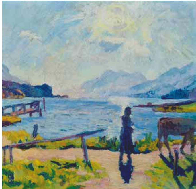
3057 Giovanni Giacometti Morgensonne am Silsersee (Morning light on the Silsersee). 1924. Oil on canvas. 35.5 x 37 cm.