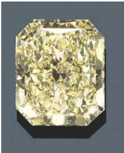
2186 An unmounted diamond 37.52 carats, Fancy Yellow / VVS2 Sold for CHF 549 000 / EUR 363 700

In what is perhaps a classic reaction to an economic downturn, auction buyers are heavily investing in precious gems and gold jewelry. At Koller on 16 June, three unmounted “fancy yellow” diamonds sold for a total of CHF 837 000 / EUR 554 500, after spirited bidding by the international trade. A stunning 16-carat diamond ring sold for CHF 102 000 / EUR 67 600. The sale totaled CHF 1.84 million / EUR 1.21 million.