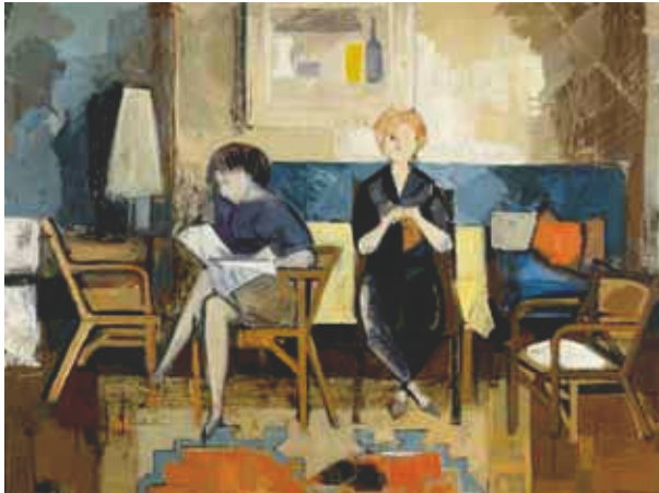
3284 Gerhard Richter Interior. 1960. Oil on masonite. 74 x 100 cm.