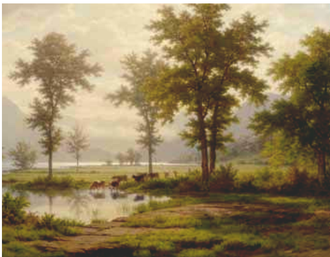
3014 Robert Zünd View of the Lake of Four Cantons. Oil on canvas. 84 x 113 cm.