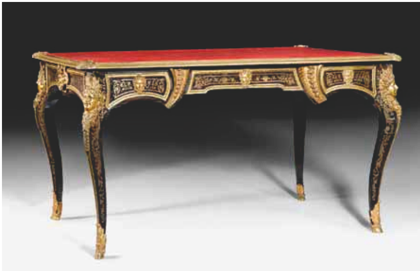
1318 BUREAU PLAT WITH BOULLE MARQUETRY, Regence style, stamped GERARD, Paris circa 1862.