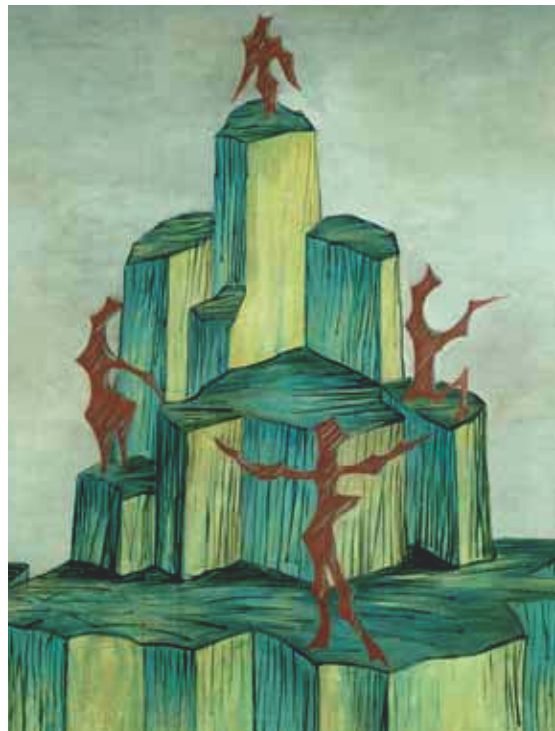
3274 Man Ray "La Montagne de Cristal." 1950. Oil on canvas. 80 x 60 cm.