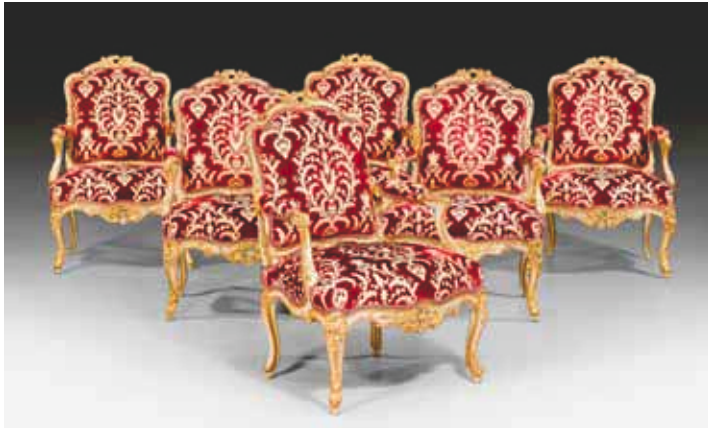
1080A Set of 6 Louis XV painted armchairs Mainfranken, probably Würzburg circa 1740/50