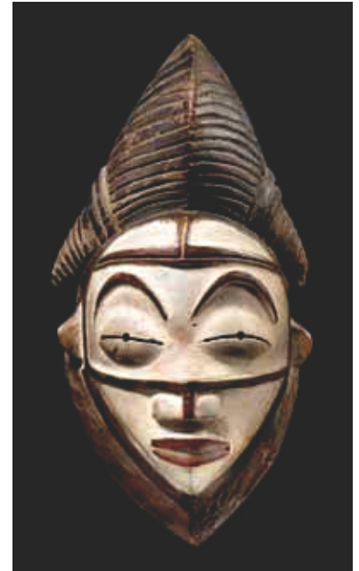
Punu mask Gabon, H 31 cm.

In total, the Tribal Art auction at Koller garnered CHF 396 000 / EUR 265 300.