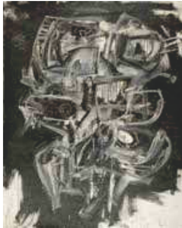
3268 Antonio Saura "La niña de los peines," 1956 Oil on canvas. 162 x 130 cm.