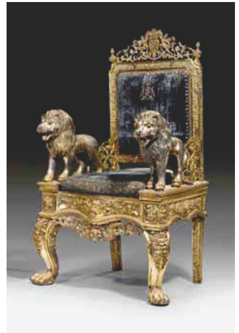
1342 A pair of Rajasthani armchairs Wood, parcel-gilt and applied with silver and semi-precious stones, circa 1870