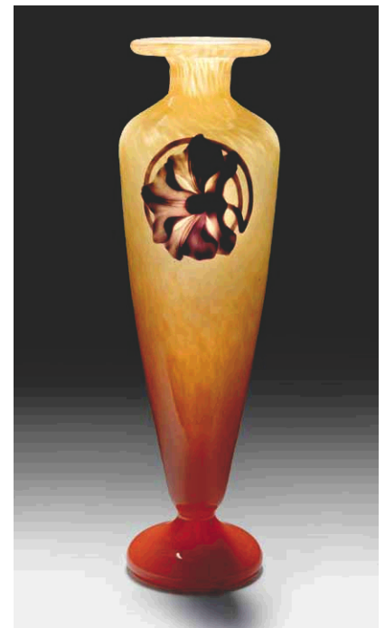
274 SCHNEIDER VASE, circa 1925. Yellow and orange mottled glass, with violet applied decoration and engraved with a flower. H 41 cm.

Estimate CHF 5 000 - 7 000 EUR 3 300 - 4 600 Sold for CHF 9 760 / EUR 6 400