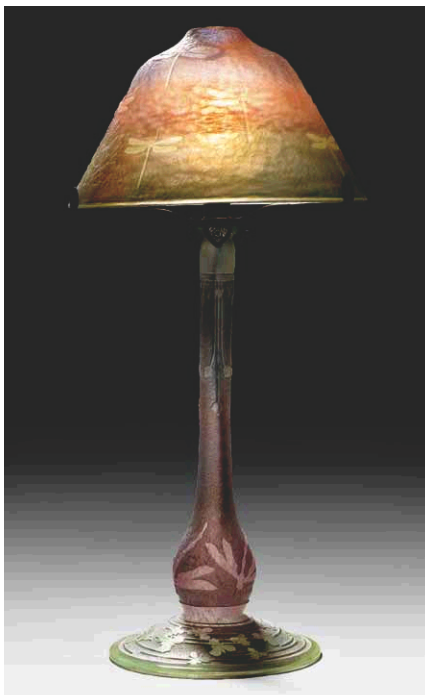
262 DAUM NANCY Lamp, circa 1900. Clear glass with mottled pink and green floral and dragonfly decoration. H 52,5 cm.

The Art Nouveau / Art Deco sale garnered in total CHF 497 000 / EUR 328 000, selling at 72% by lot and 106% by value.