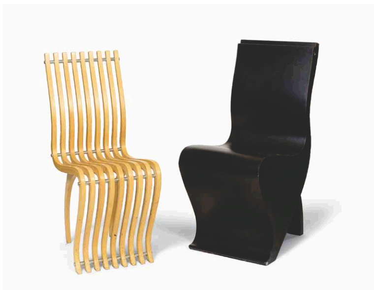
80 RON ARAD "And the Rabbit Speaks" chair, 1994. Edition of 20. Two chairs in wood and metal with a metal

Estimate CHF 35 000 - 55 000 / EUR 23 000 - 35 000 Sold for CHF 48 400 / EUR 32 000