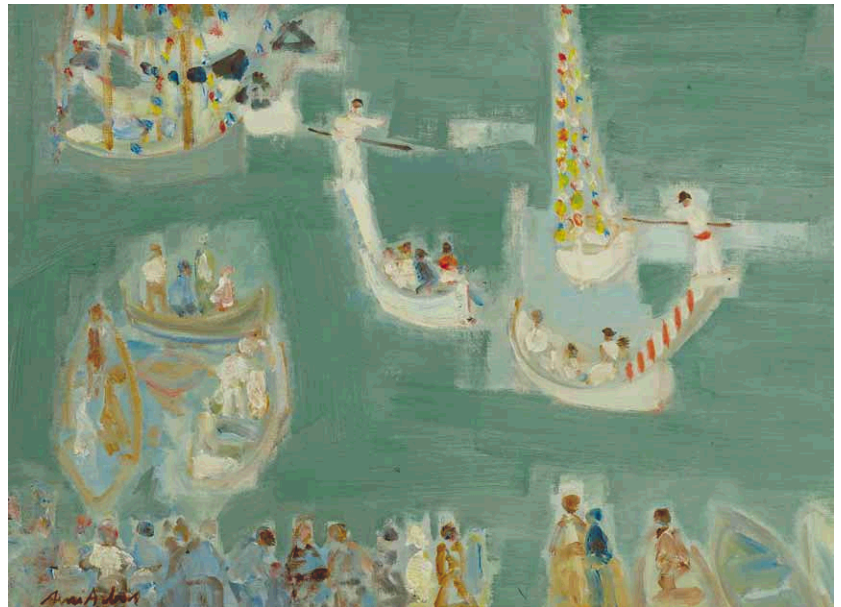
850 AVNI ARBAS Venice. Oil on canvas. 51x70 cm.

Estimate CHF 6 000 - 8 000 / EUR 4 000 - 5 300 Sold for CHF 20 740 / EUR 13 700