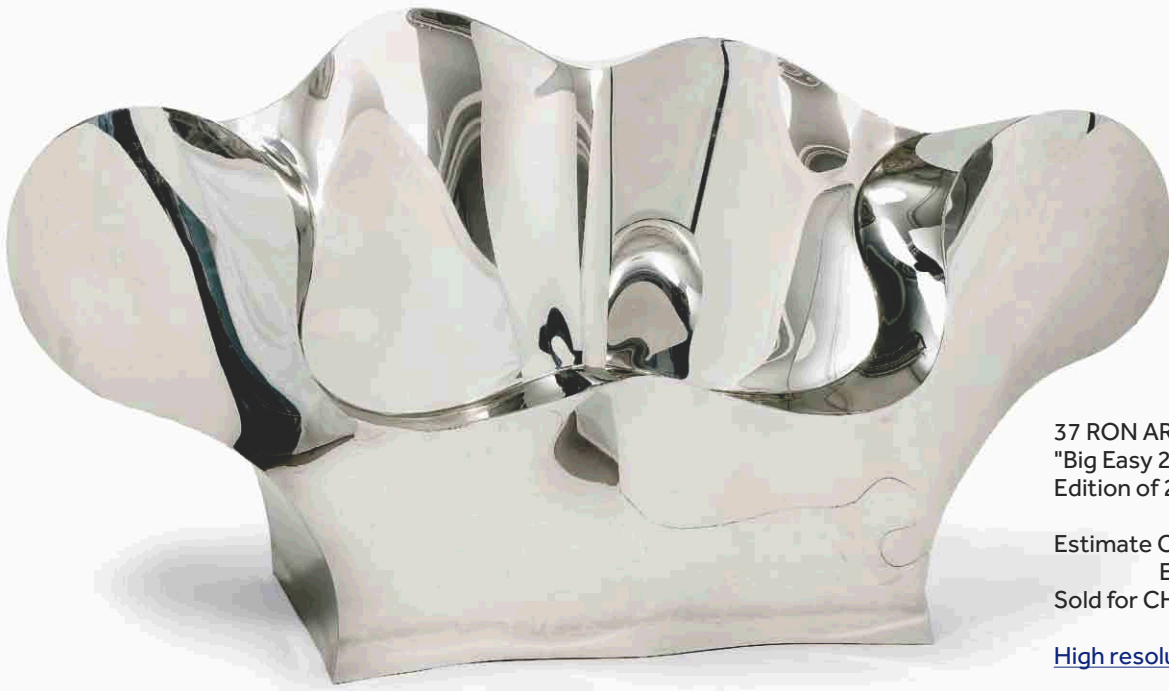
37 RON ARAD "Big Easy 2 for 2" sofa, design 1989. Edition of 20.

Estimate CHF 80 000 - 120 000 EUR 50 000 - 80 000 Sold for CHF 146 400 / EUR 96 600