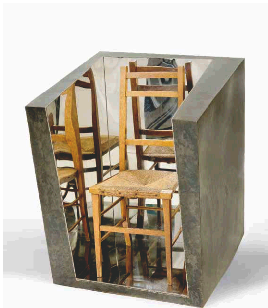
14 RON ARAD "Appropriate" chair, design 1994. Edition of 20. "Traditional" chair presented in an

Estimate CHF 40 000 - 60 000 / EUR 25 000 - 40 000 Sold for CHF 54 900 / EUR 36 200