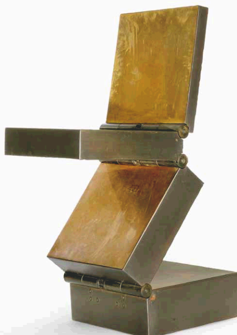
61 RON ARAD "Box in 4 Movements" chair, design 1994. Edition of 20.

Estimate CHF 35 000 - 50 000 / EUR 23 000 - 33 000 Sold for CHF 75 640 / EUR 50 000