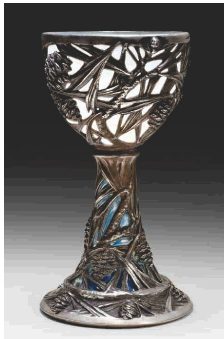
351 RENE LALIQUE Chalice, 1902. Opaline glass and silver. H 19 cm.

Estimate CHF 18 000 - 25 000 EUR 11 700 - 16 300 Sold for CHF 21 960 / EUR 14 500