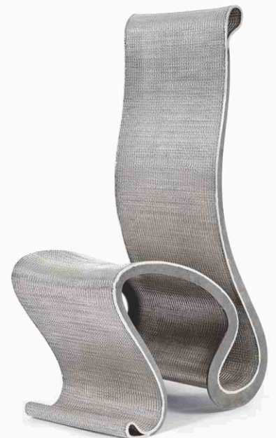
27 RON ARAD "Loop Loop" chair. Edition of 5, signed and dated 1994.

Estimate CHF 65 000 / 90 000 / EUR 40 000 / 60 000 Sold for CHF 134 200 / EUR 88 600