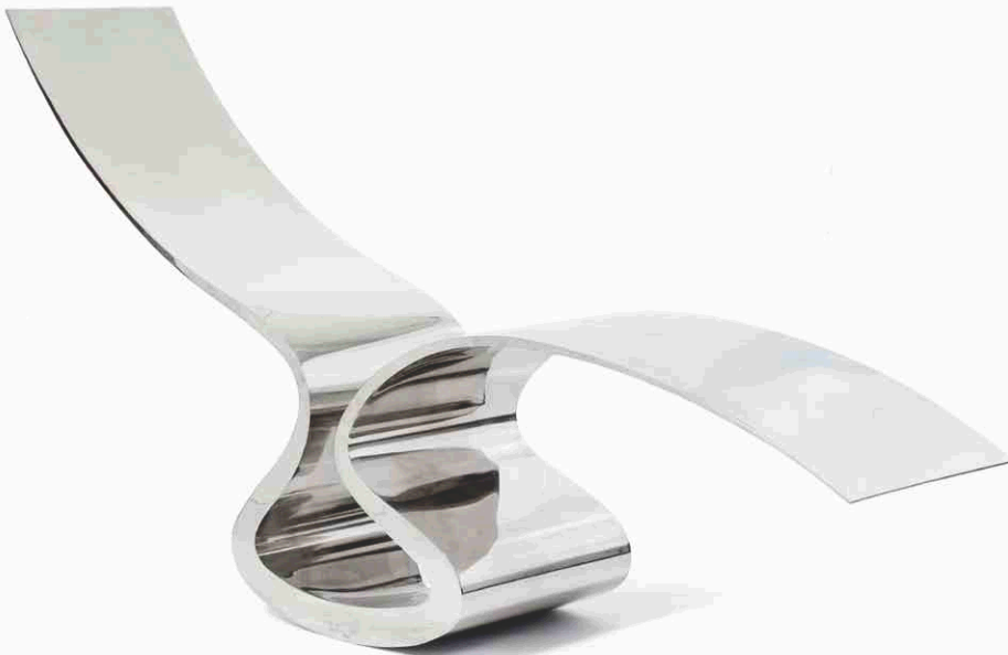
46 RON ARAD "After spring" chair, design 1992. Edition of 3 artist's proofs.

Estimate CHF 120 000 - 180 000 / EUR 80 000 - 120 000 Sold for CHF 137 860 / EUR 91 000