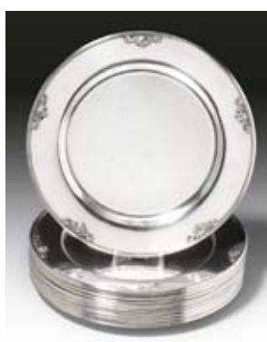
G46/82 GEORG JENSEN 12 silver plates, after 1946.