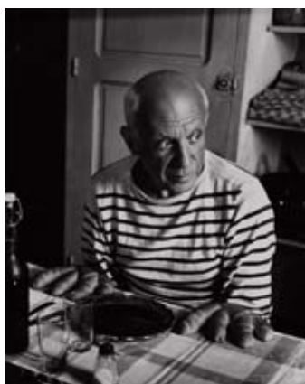
G46/529 ROBERT DOISNEAU "Les pains de Picasso". 1952. Later gelatin silver print. Ca. 38x24 cm.

A series of images by Robert Doisneau was headed by the playful "Les pains de Picasso" (lot 529), that fetched CHF 6 100 / EUR 4 270. Among the numerous photos of Marilyn Monroe, Cartier-Bresson's image of the star lost in a moment of private reflection during the shooting of "The Misfits" (lot 533) brought CHF 8 540 / EUR 6 000.