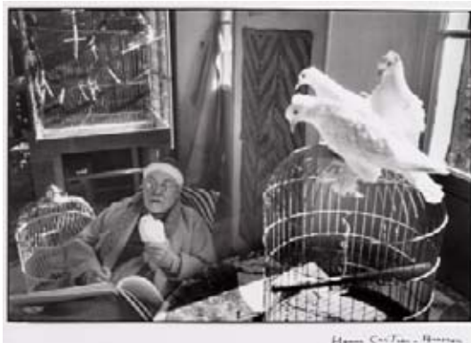
G46/508 HENRI CARTIER-BRESSON Henri Matisse. 1944. Later gelatin silver print. Ca. 30x40 cm.