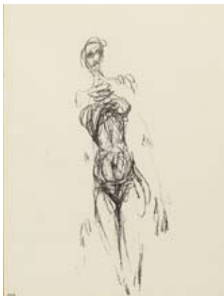
G46/632 ALBERTO GIACOMETTI "Paris sans fin". 1969.

Alberto Giacometti's final, unfinished ode to his beloved Paris, "Paris sans Fin" (lot 632) sold for above its high estimate despite its unusual condition, with many of the individual prints removed and framed, for CHF 34 160 / EUR 23 900. Books illustrated by Salvador Dalí remain attractive, as witnessed by the two works in this auction: the rare "Les Chevaux de Dalí" (lot 625) and "Casanova" (lot 627), each selling for CHF 4 270 / EUR 3 000. Cezanne, Renoir and Pissarro were among the artists who illustrated "Histoire des peintres impressionnistes" (lot 630) by turn-of-the-century painting dealer Théodore Duret, which fetched CHF 5 490 / EUR 3 840.