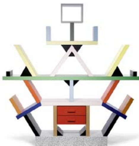
G46/298 ETTORE SOTTASS "Carlton" book case. Design 1981 for Memphis ed. 190x32x197 cm.