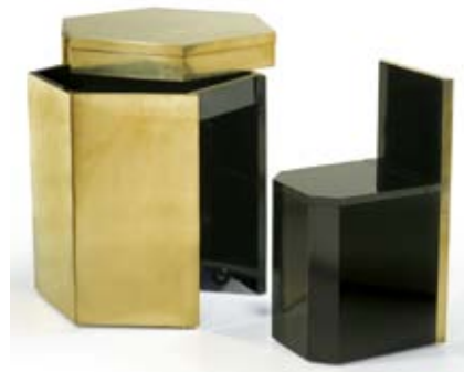
G46/256 GABRIELLA CRESPI "Coiffeuse Hexagonale." Model 2004/94.