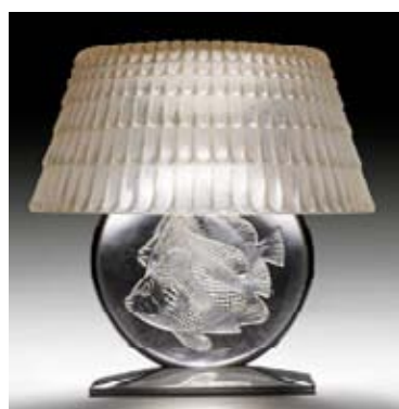
G46/27 RENE LALIQUE "Poissons" lamp, circa 1940. H 31 cm.

Among the Georg Jensen silver, a set of twelve "acorn" pattern plates (lot 82) sold for five times their estimate for a surprising CHF 24 400 / EUR 17 000.