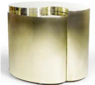
G46/254 GABRIELLA CRESPI "Nautilus" Bar. Model 2081. 78x90x100 cm.