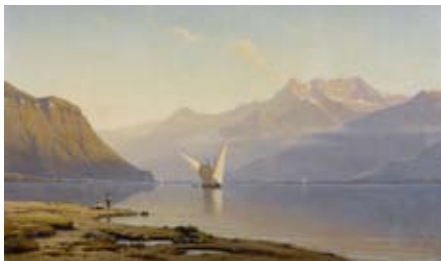
G46/402 AUGUSTE VEILLON "Vue du lac Léman et des Dents-du-Midi". 1867. Oil on canvas. 158x105 cm.

Other highlights included a stunning Lake of Geneva view by Swiss artist Auguste Veillon (lot 402) that sold for more than five times its pre-sale estimate at CHF 41 480 / EUR 29 000*, and a nude by self-taught artist Mahmoud Saïd (lot 426) that fetched CHF 48 800 / EUR 34 160, proof that Saïd's fame has spread beyond the borders of his native Egypt.