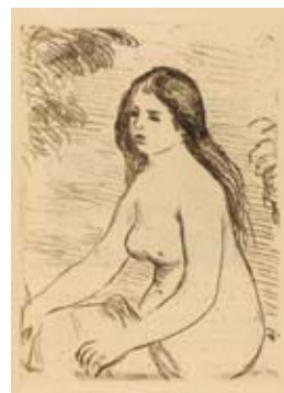
G46/630 THEODORE DURET "Histoire des peintres impressionnistes". 1909.