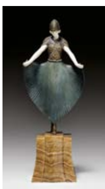
G46/99 DEMETRE CHIPARUS "Actress." H 30 cm.