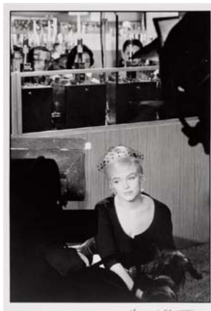
G46/533 HENRI CARTIER-BRESSON Marilyn Monroe in Reno. 1961. Later gelatin silver print. Ca. 45x30 cm.