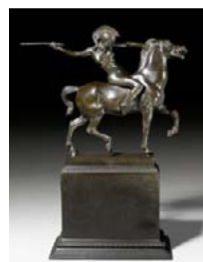
G46/115 FRANZ VON STUCK Amazon on horseback. L 40 cm.