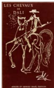
G46/625 SALVADOR DALI, ALAIN DECAUX, LEON ZITRONE and YVES SAINT-MARTIN "Les chevaux de Dalí". 1983.