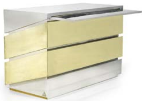
G46/257 GABRIELLA CRESPI "Commode Mr/Mme." Model 2075/5.

Memphis furniture from the 1980s also sold very well in this sale, such as the anthropomorphic "Carlton" model bookcase from 1981 (lot 298) that fetched CHF 10 370 / EUR 7 260. Apparently the current vogue for everything 80s also includes the design market.