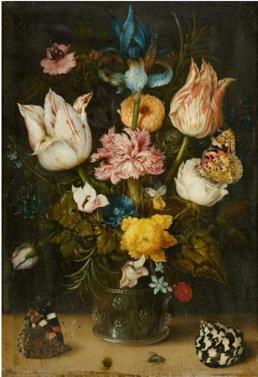
AMBROSIUS BOSSCHAERT L'ANCIEN