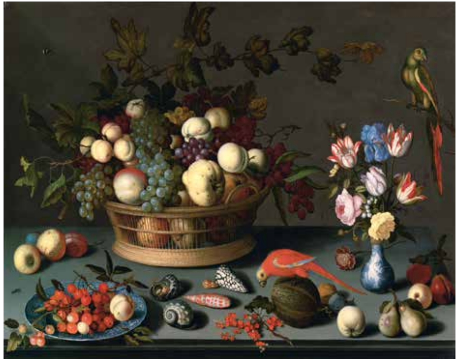
BALTHASAR VAN DER AST. Large still life with fruit and flowers. Circa 1620. Oil on panel. 77 x 107 cm. CHF 850 000 – 1.2 million

This work, which dates from circa 1620, is representative of the Utrecht period of the Dutch master, during which the art of the still life entered one of its most exciting periods, and Van der Ast began to develop his own style as distinguished from that of his master, Ambrosius Bosschaert the Elder (1573-1621).