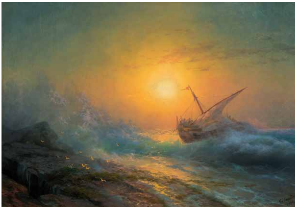
IVAN KONSTANTINOVICH AIVAZOVSKY (1817 Feodosija 1900). A stormy sea at sunset. 1896. Oil on canvas. 68 x 99 cm. CHF 380 000 – 550 000

Zurich – Koller's spring auctions feature an impressive selection of furniture and clocks from several Swiss private collections, including a German Neoclassical desk which once belonged to the royal collection of the New Palace in Stuttgart. Coinciding with the 200th anniversary of the birth of Russian artist Ivan Aivazovsky, one of the highlights of the 19th Century Paintings auction is a recently rediscovered marine painting by the artist. The Old Master Paintings sale includes an important large-format still life by Dutch master Balthasar Van der Ast. Other highlights include a large Flora Danica porcelain service, and a rare music manuscript by composer Felix Mendelssohn.