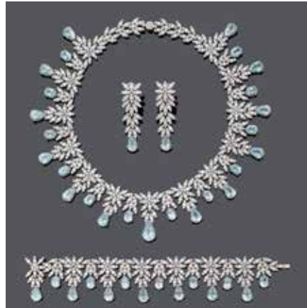
AQUAMARINE AND DIAMOND PARURE, by Pasquale Bruni. Ghirlanda Collection, Ref. 12542B. Comprising a necklace, a matching bracelet and a pair of ear pendants. CHF 120 000 - 180 000.