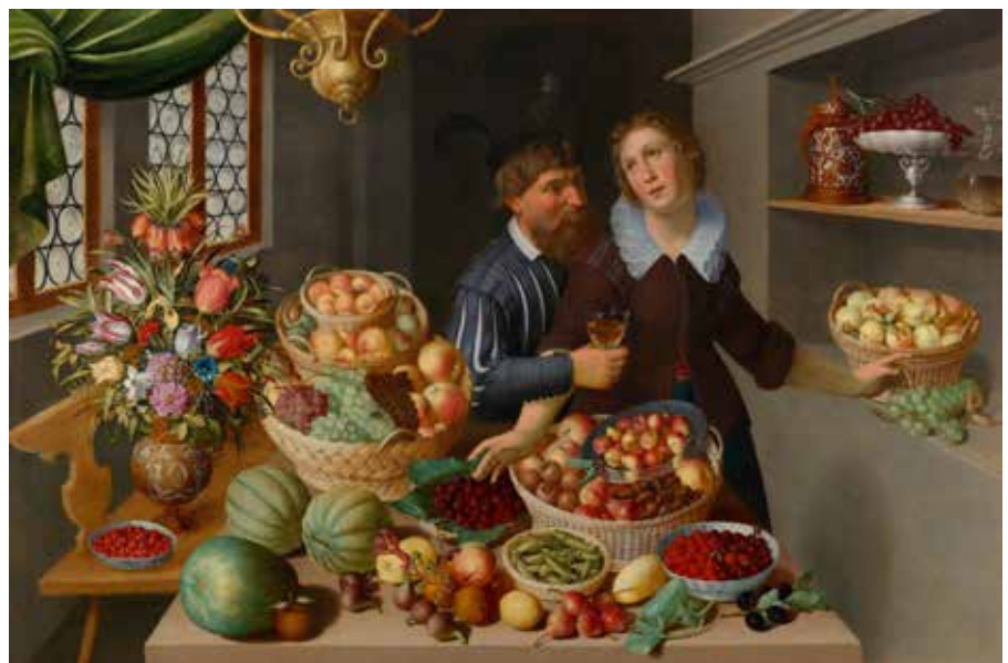
GEORG FLEGEL and probably MARTEN VAN VALKENBORCH. Large still life with fruit, vegetables and flowers, and a couple in an interior. Circa 1610-15. Oil on canvas. CHF 300 000 – 500 000

The painting is rich in symbolism, found particularly in the gestures of the young woman: with her left hand, she points to a bunch of pristine grapes, symbols of chastity and virginity, while her right hand designates a plate of mulberries, which represent the Last Judgement, and an admonition to lead a good life.