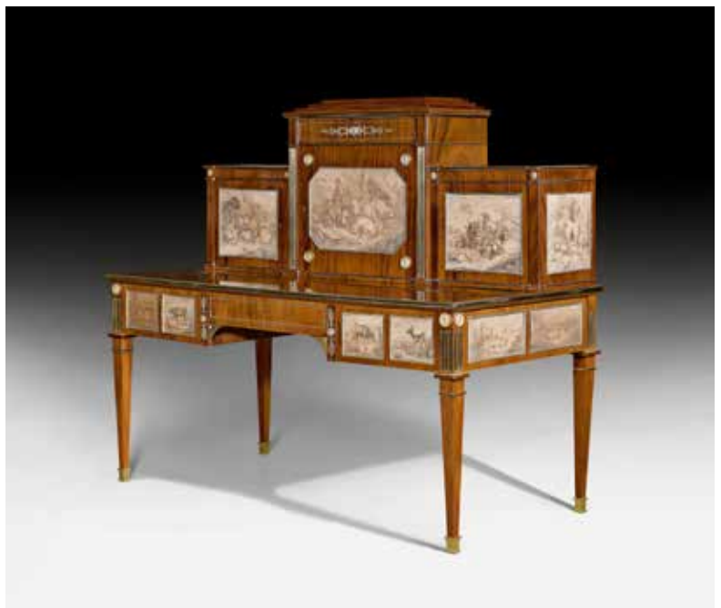
A ROYAL NEOCLASSICAL "BUREAU A GRADIN". JOHANN KLINCKERFUSS, circa 1800. Provenance: The New Palace, Stuttgart. CHF 120 000 – 200 000

The selection of furniture in Koller's 30 March auction is particularly outstanding, thanks to works from several Swiss private collections. Among the highlights is a royal "bureau à gradin" which was for several decades part of the collection of the New Palace in Stuttgart (lot 1206, CHF 120 000 – 200 000). Made by court cabinet-maker Johann Klinckerfuss in circa 1800, this extraordinary piece of furniture is adorned with original pencil drawings of landscapes and animals, most likely drawn by Queen Charlotte of Württemberg.