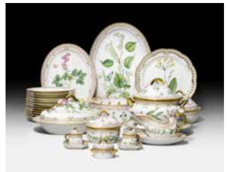
FLORA DANICA. A table service of over 150 pieces. Royal Copenhagen.

In the Porcelain section of the sale a large “Flora Danica” service by Royal Copenhagen will be offered. Flora Danica is one of the most sought-after services in the world, and this one, comprising an unusually large number of pieces – over 150 – will be offered in several lots (lots 1407-1429, low estimates totalling circa CHF 40 000).