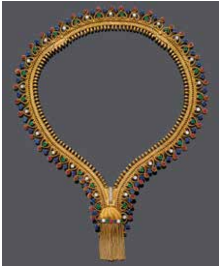
MULTIGEM AND DIAMOND NECKLACE / BRACELET, BY VAN CLEEF & ARPELS, circa 1950. Total weight of rubies and sapphires ca. 9.90 ct, of emeralds ca. 1.40 ct and of diamonds ca. 1.50 ct. CHF 130 000 - 200 000.