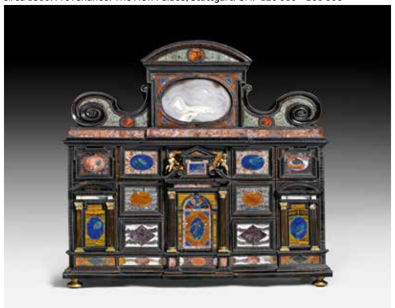
A FLORENTINE RENAISSANCE "PIETRA PAESINA" CABINET. 17th century. CHF 100 000 – 200 000

Other stellar works from the Furniture auction are an important Directoire mantel clock "à l'Indien et l'Indienne enlacés" illustrating the theme of the "noble savage" cherished by the French aristocracy at the turn of the 19th century (lot 1241, CHF 250 000 – 350 000); a stunning Florentine Renaissance "pietra paesina" cabinet (lot 1024, CHF 100 000 – 200 000), and a pair of Louis XV Boulle marquetry corner cabinets by royal cabinetmaker Joseph Baumhauer (lot 1070, CHF 150 000 – 250 000).