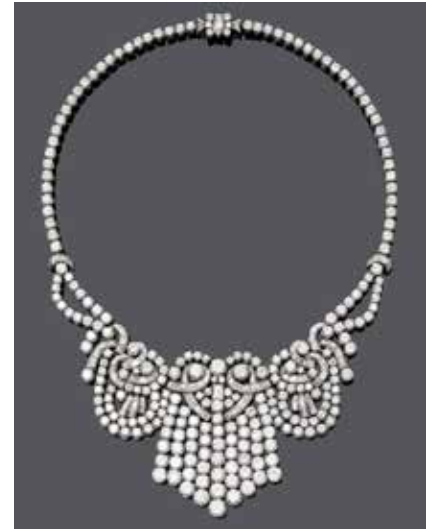
DIAMOND NECKLACE, circa 1950. Set with diamond baguettes weighing 18 ct and brilliant-cut diamonds totalling 73 ct. CHF 130 000 - 200 000