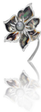
Chaumet brooch (lot 2032)

Over 200 lots of vintage and modern jewellery will be offered at Koller on 21 March, including signed pieces by Chaumet, Bulgari, Van Cleef & Arpels, Tiffany, Gübelin, Hemmerle, Fumanti, Binder, Cartier and more. The top lot is a ruby and diamond ring with an unheated 10.47 ct. ruby from Mozambique (lot 2059, est. CHF 280 000 – 380 000), and the cover lot is a pearl and diamond flower brooch by Chaumet, estimated at CHF 14 000 – 20 000 (lot 2032).