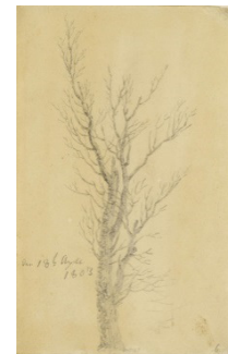
Caspar David Friedrich (lot 3457)