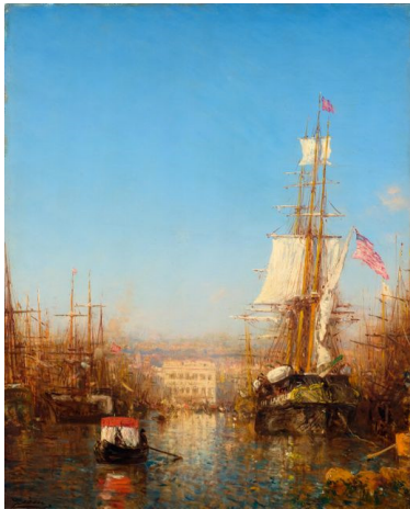
Félix François Ziem (lot 3205)

The 19 th Century Paintings auction features a landscape by Jean-Baptiste Camille Corot which was formerly in the collection of the 19 th -century Scottish railway engineer James Staats Forbes (lot 3214, est. CHF 60 000 – 90 000). Painted by Corot in the year before his death, it is a work by an artist in full maturity and at the height of his talents, as well as a leave-taking of his beloved forest. A magnificent view of the Port of Marseille by Félix François Ziem (lot 3205, est. CHF 40 000 – 60 000) provides a colourful counterpoint to a series of chiaroscuro interiors of monks enjoying a nip of beer or wine by the Bavarian artist Eduard Grützner (lots 3208-3212), all from a southern German private collection.