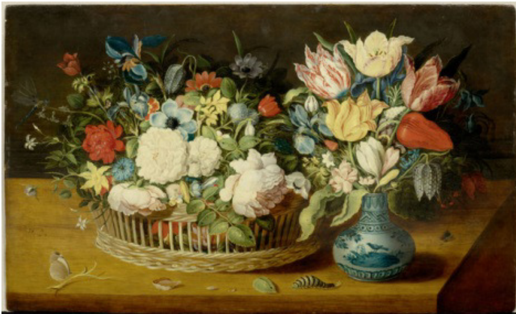
Osias Beert (lot 3031)

Old Master & 19 th Century Paintings, Drawings & Prints – Fine Furniture, Clocks & Sculpture – European Ceramics and Porcelain, Featuring the Max Fahrländer Collection – Silver – Carpets – Rare Books – Photographs – Jewellery