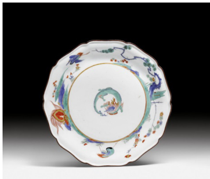
Meissen Flaming Tortoise plate (1737)

the 19 th century furnishings, a pair of large ormolu-mounted vases formerly in the Beverly Hills home of Suzanne Saperstein, "Fleur de Lys", comes to the block with an estimate of CHF 30 000 – 50 000 (lot 1279).