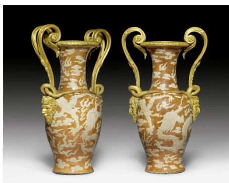
From the Saperstein collection (1279)