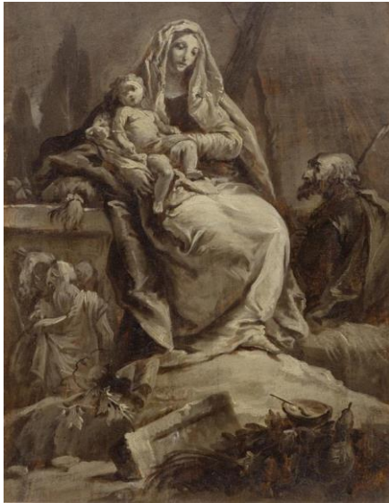
Attributed to Giovanni Domenico Tiepolo. The Rest on the Flight into Egypt. Circa 1745/50. Oil on paper, laid on canvas. 39 x 30 cm. CHF 20 000 – 30 000.

Two works by Giovanni Domenico Tiepolo (1727 Venice 1804) are featured in the Drawings auction on 23 September: an oil sketch depicting the Rest on the Flight into Egypt (lot 3425, CHF 20 000 – 30 000), and a brown ink drawing of a standing figure in Oriental dress (lot 3452, CHF 6 000 – 9 000). Both works are remarkable for their powerful spontaneity. The oil study may have been made either as a model for Tiepolo's workshop or for direct sale, as there was already a market for such studies in Tiepolo's lifetime. A very similar study is in the collection of the Kunsthaus Zurich.