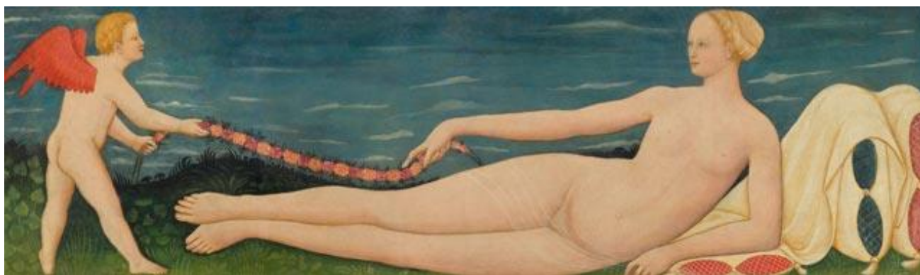
Paolo Schiavo. Venus and Cupid. Circa 1440-45. Tempera on panel. 50.8 x 170 cm. CHF 250 000 – 350 000

Among the series of striking works from the Italian Renaissance to be offered by artists such as Tommaso di Credi, Giuliano di Amadeo, and Andrea Manzini (known as Andrea di Giusto), one rare and beautiful panel is particularly outstanding: a reclining Venus with Cupid in a landscape by Paolo Schiavo (Florence 1397–1498 Pisa). Formerly in the collection of the J. Paul Getty Museum, it was later included in the exhibition "Art and Love in Renaissance Italy" at the Metropolitan Museum of Art in New York. Dating from the beginning of the Italian Renaissance, circa 1440-45, its original function was as an interior panel of a marriage coffer ( cassone ) made to hold a bride's trousseau, of which relatively few survive today (lot 3013, CHF 250 000 – 350 000).