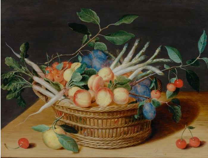
Isaac Soreau. Still life with fruit and vegetables in a woven basket. Oil on panel. 40.5 x 51.4 cm. CHF 150 000 / 250 000

Koller auctions will offer the collection of Marie Teres Schmitz-Eichhoff on 19 and 23 September. The Cologne collector's sharp and discerning eye was eclectic, but the core of her collection consisted of old master paintings and drawings, and Baroque trompe l'oeil faience.