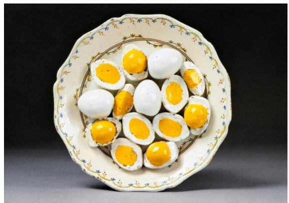
A mid-18th century French trompe-l'oeil platter. CHF 4 000 – 6 000.

The Baroque period was a time of opulent feasts, as the European upper classes attempted to outdo one another in everything regarding fashion, including extravagant table settings. Trompe-l'oeil ceramics were among the highlights of such table settings, and dinner guests greatly enjoyed seeing platters decorated with faux vegetables and fruit, casseroles in the form of cabbage heads, and animal-shaped bowls for pastries and ragouts. Among the highlights of the collection are a mid-18th century French trompe-l'oeil platter with eggs (lot 1751, CHF 4 000 – 6 000); a pair of mid-18th century Delft blackberry jam terrines (lot 1729, CHF 3 000 – 5 000) and a large mid-18 th century cabbage-shaped terrine, Brussels, Philippe Mombaers (lot 1742, CHF 6 000 – 8 000).