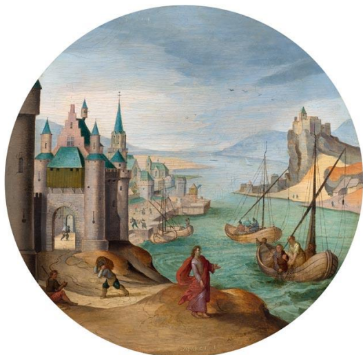
Abel Grimmer. Five Allegories of the months of the year. Oil on panel. Diam. 25 cm. CHF 90 000 – 140 000 each