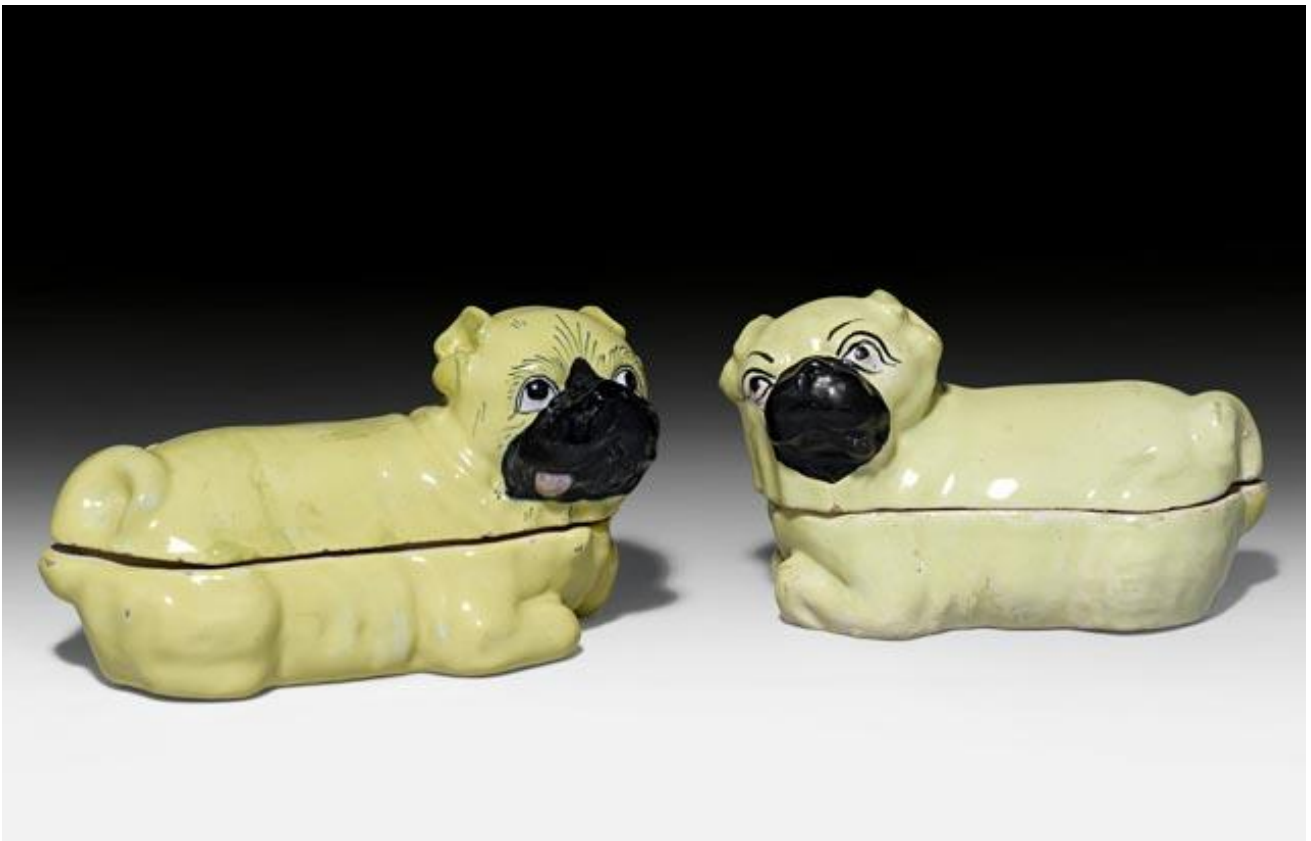
A pair of pug-dog shaped terrines, ca. 1770. From the Schmitz-Eichhof Collection, at auction on 19 September. Est. CHF 1 500 – 2 500.

Museum-quality artworks will come to auction during the September sales at Koller Zurich. A rare Renaissance panel depicting Venus and Cupid by Paolo Schiavo was formerly in the collection of the J. Paul Getty Museum, and later was shown in the exhibition “Art and Love in Renaissance Italy” at the Metropolitan Museum of Art in New York. Two still lifes by Georg Flegel and Isaac Soreau were also part of a major exhibition, “Die Magie der Dinge” (The Magic of Things) in Basel and Frankfurt in 2008-2009, and several faïence pieces to be offered have been featured in museum exhibitions in Cologne and Düsseldorf. One of the highlights of the furniture auction is an upright piano made for Baron James de Rothschild.