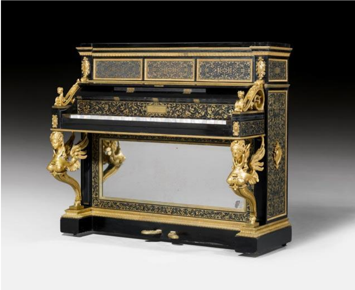
A Louis-Philippe upright piano “aux sphinges ailées” with Boulle marquetry. Signed Ignace Pleyel & Comp., for Baron James de Rothschild. CHF 150 000 / 250 000.

The furniture auction on 22 September features an upright piano “aux sphinges ailées” created by a trio of the finest master craftsmen of the 19th century (lot 1293, CHF 150 000 – 250 000). Commissioned in 1836 by Baron James de Rothschild for his luxurious townhouse on the Rue Laffitte in Paris, the mechanism was created by royal piano maker and composer Ignace Pleyel (Ruppersthal 1757-1831 Paris), the case finished in brass “Boulle” marquetry on ebony by the cabinetmaker to the royal family, Alexandre Bellangé (1799 Paris 1863), and the ormolu mounts in the form of winged sphinxes were crafted by master bronze maker Jean Jacques Feuchère (1807 Paris 1852).