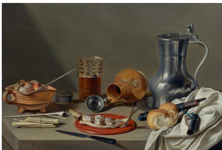
Pieter Claesz. Still life with smoker's requisites. 1627. Oil on panel. CHF 500 000 – 700 000