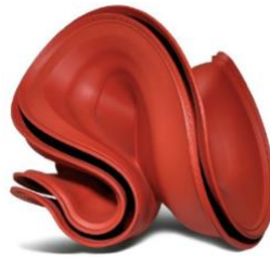
TONY CRAGG Red Square. 2007. Bronze, coloured. 70 x 80 x 66 cm. Sold for CHF 144 500