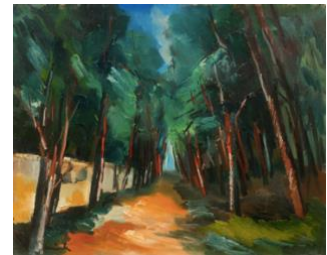
MAURICE DE VLAMINCK L'Allée. Circa 1912-14. Oil on Canvas. 66 x 81 cm. Sold for CHF 204 500