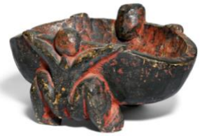
ERNST LUDWIG KIRCHNER Obstschale II. Circa 1910. Wood, red coloured. Monogrammed on the underside: ELK. 17 x 38 x 24 cm. Sold for CHF 186 500