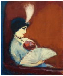
KEES VAN DONGEN Portrait de femme. Circa 1913. Oil on Canvas. 65 x 55 cm. Sold for CHF 240 500