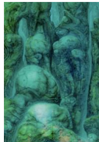
H. R. GIGER Lord of the Rings I. 1975 Acrylic on paper on panel. 100 x 70 cm. Sold for CHF 144 500