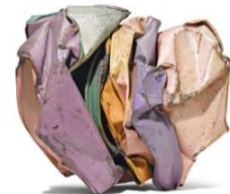
JOHN CHAMBERLAIN Kiss #18. 1979. Painted steel. 68.5 x 59.5 x 61 cm. Sold for CHF 526 500