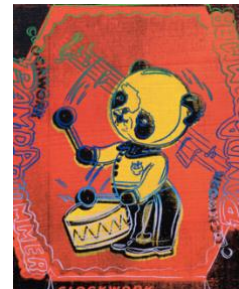
ANDY WARHOL Clockwork Panda Drummer (from the Toy Series). 1983 Synthetic polymer and screenprint on canvas. 35.5 x 27.7 cm. Sold for CHF 192 500