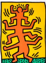
KEITH HARING Growing. 1988. Colour screenprint. AP 2/15. Sold for CHF 58 100