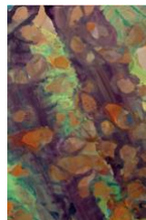
KATHARINA GROSSE 1020S. 2006. Acrylic on Canvas. 142x82 cm. Sold for CHF 58 100