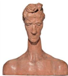
WILHELM LEHMBRUCK "Rising Youth". 1913. Cast stone, lifetime cast. Height: 53.3 cm. Sold for CHF 324 500