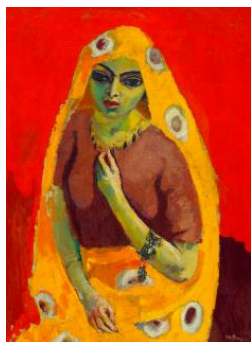
Kees Van Dongen L'Égyptienne. 1910-11. Oil on canvas. 100 x 73 cm Sold for CHF 1,7Mio.

Koller's auctions on 29 – 30 June were marked by strong bidding for Modern & Contemporary works, which often sold far above expectations. The fine art auctions concluded with total sales far exceeding the pre-sale estimates.