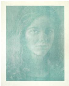
FRANZ GERTSCH Dominique. 1988. Woodcut in colour. 7/18. Signed in pencil on the reverse: Franz Gertsch. Image 234 x 181 cm on Japan paper by Heizoburo 275 x 219 cm. Sold for CHF 168 500