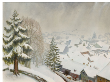
3217 OTTO DIX Wintertag in Randegg . 1933 Mixed media on panel. 60 x 80 cm. Sold for CHF 174 000