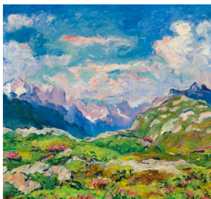
3046 GIOVANNI GIACOMETTI Val Bregaglia with a view of the Sciora group . 1931. Oil on canvas. 75.5 x 80 cm. Sold for CHF 312 000