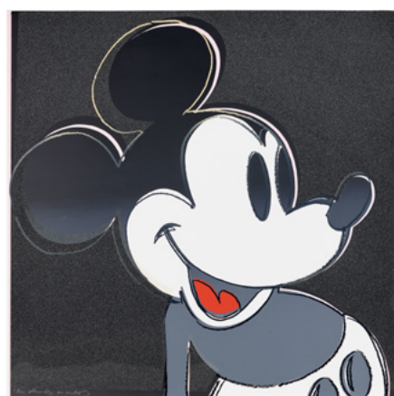
3420 ANDY WARHOL Mickey Mouse . 1981. Colour screenprint with diamond dust. 96.5 x 96.5 cm. Sold for CHF 96 000 World auction record for this print