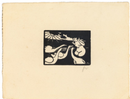
3601 FELIX VALLOTTON Les Petites Baigneuses (detail). 1893. Portfolio of 10 woodcuts. 12 x 16,5 cm each. Sold for CHF 168 000 World auction record for a series of prints by the artist

"21,000 ... 22,000 ... 23,000 ..." the bids called out by auctioneer Cyril Koller had clients in the packed saleroom checking and re-checking their catalogues – the first lot of Koller's Prints & Multiples auction on 8 December was estimated at CHF 1,500 – 2,500, and already the bidding was well into five figures. Despite its small format, the suite of ten small-format woodcuts by Felix Vallotton entitled "Les Petites Baigneuses" had become a must-have lot for several collectors. "45,000 ... 46,000 ... 47,000..." in increments of 1,000 francs, two collectors carried the bidding war on to a new auction record for any set of prints by the artist: CHF 168,000.