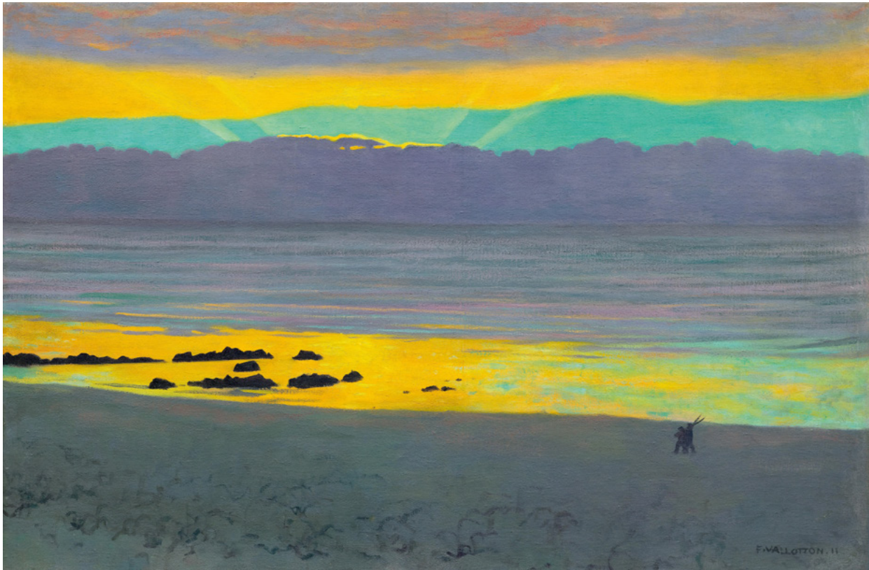
3029 FELIX VALLOTTON Coucher de soleil jaune et vert. Oil on canvas. 54 x 81 cm. Sold for CHF 883 000