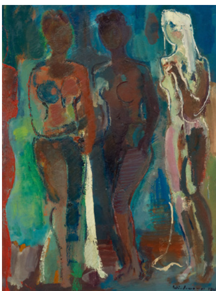
3235 GUILLERMO WIEDEMANN Nocturno . 1947. Oil on board. 80 x 60 cm. Sold for CHF 77 000 World auction record for the artist