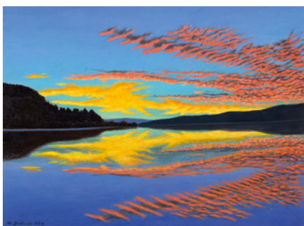
3038 ADOLF DIETRICH Abendstimmung am Untersee . 1926. Oil on board. 32.7 x 42.9 cm. Sold for CHF 480 000