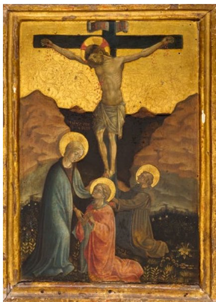
3005 SCHOOL OF THE MARCHES, 1ST HALF OF THE 15TH CENTURY The Crucifixion. Tempera and gold ground on panel. 42 × 30.2 cm.