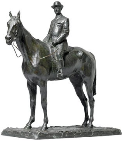
1361 PAUL TROUBETZKOY Ettore Bugatti on horseback. 1929. Bronze with dark brown patina. 54 × 31 × 62 cm. Sold for CHF 128 000