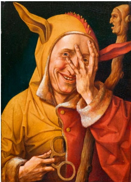
3012 MASTER OF 1537 / FRANS VERBEECK (?) Portrait of a jester. Circa 1550. Oil on panel. 33.9 × 24.6 cm.