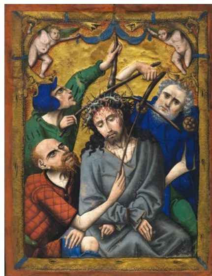
3015 SOUTHERN NETHERLANDS/GERMANY CIRCA 1500 Christ with the crown of thorns. Tempera and gold ground on canvas. 47 × 37.5 cm (visible dimensions).