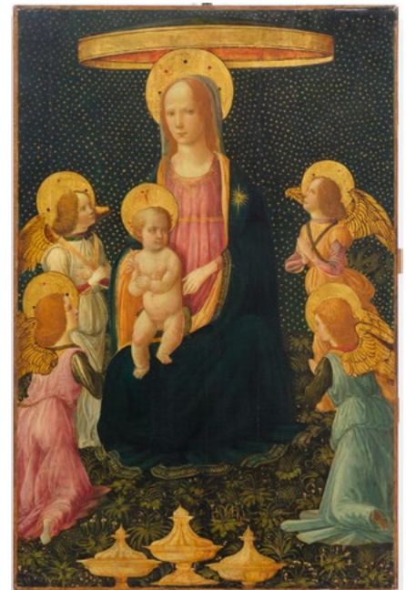
3009 MASTER OF MARRADI Virgin and Child surrounded by angels. Circa 1500. Tempera on panel. 67 × 44.5 cm.