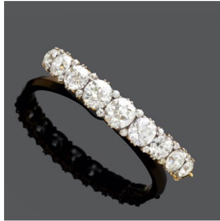
2190 DIAMOND BANGLE Circa 1880. Pink gold and silver. Set with 9 graduated circular-cut diamonds totalling 26.02 ct. Sold for CHF 171 000