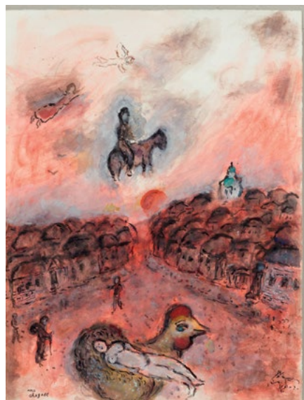
3249 MARC CHAGALL Repos sur coq et chevauchée au village rouge. 1975-78. Gouache, tempera and ink on paper. 65.3 × 50 cm.