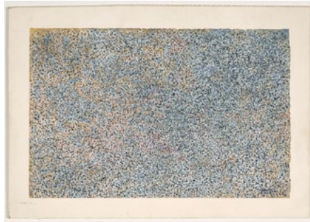
3409 MARK TOBEY Multi-Movements in Time. 1958. Tempera and ink on wove paper. 16 × 25 cm.