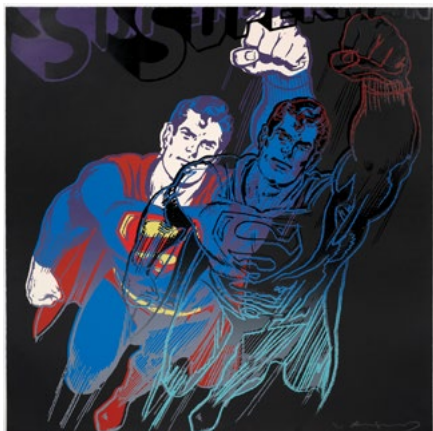
3709 ANDY WARHOL Superman. 1981. Colour screenprint with diamond dust. 8/200.