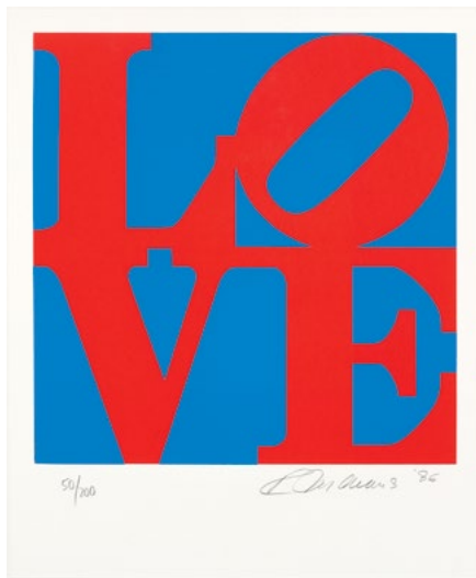
3716 ROBERT INDIANA The Book of Love. 1996. Portfolio with 12 colour screenprints. 50/200.