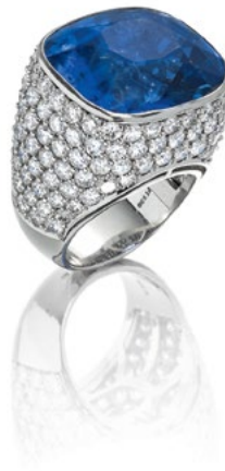
2222 BURMA SAPPHIRE AND DIAMOND RING Set with an antique ovale Burma sapphire, 37.67 ct, unheated.