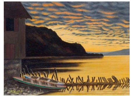
3061 ADOLF DIETRICH Evening atmosphere on the lake with clouds. 1918. Oil on board. 29 × 36.5 cm.