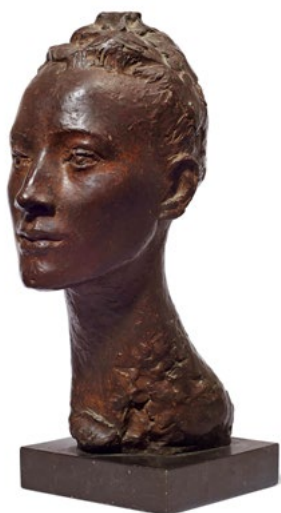
3226 GERMAINE RICHIER La Régodias (Renée Régodias). 1938. Bronze with brown patina. 40 × 17 × 20 cm.