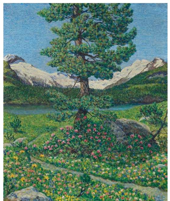
3066 GOTTARDO SEGANTINI Maloja "Paesaggio paradisiaco". 1920. Oil on canvas. 120 × 100 cm.