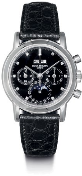
2892 PATEK PHILIPPE Chronograph with perpetual calendar. 1998. Platinum 950. Ref. 3970 E