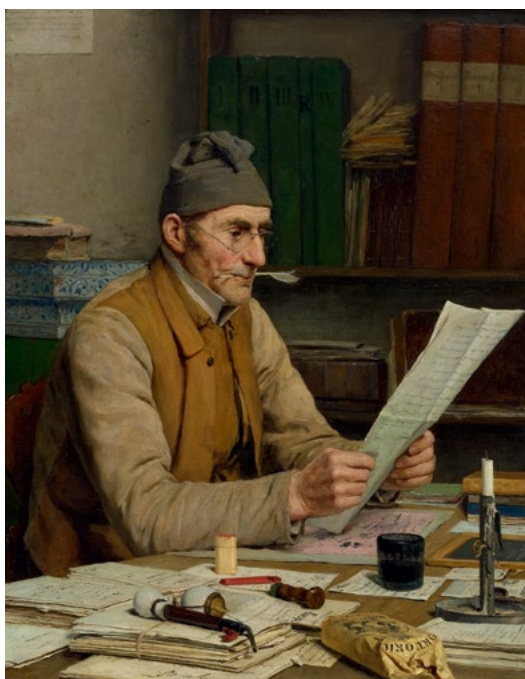
3013 ALBERT ANKER The Village Clerk V. 1899. Oil on canvas. 62.5 × 49 cm.