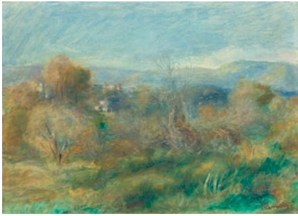
3211 PIERRE-AUGUSTE RENOIR Paysage, vallée village sur la hauteur et fond de montagnes. 1900. Oil on canvas. 26 × 36 cm.