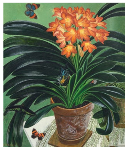
3037 ADOLF DIETRICH Clivia. 1943. Oil on paper. 65 × 57 cm.