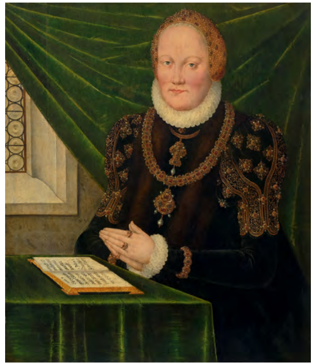
3017 LUCAS CRANACH the Younger and workshop Portrait of Anna of Dänemark (1532–1585), Electress of Saxony. Oil on panel. 57.7 × 49.1 cm. Sold for CHF 66 000