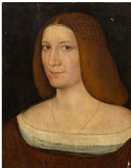
3019 NORTH ITALIAN MASTER, CIRCA 1515–20 Portrait of a lady. Oil on panel. 25.7 × 20 cm. Sold for CHF 78 000