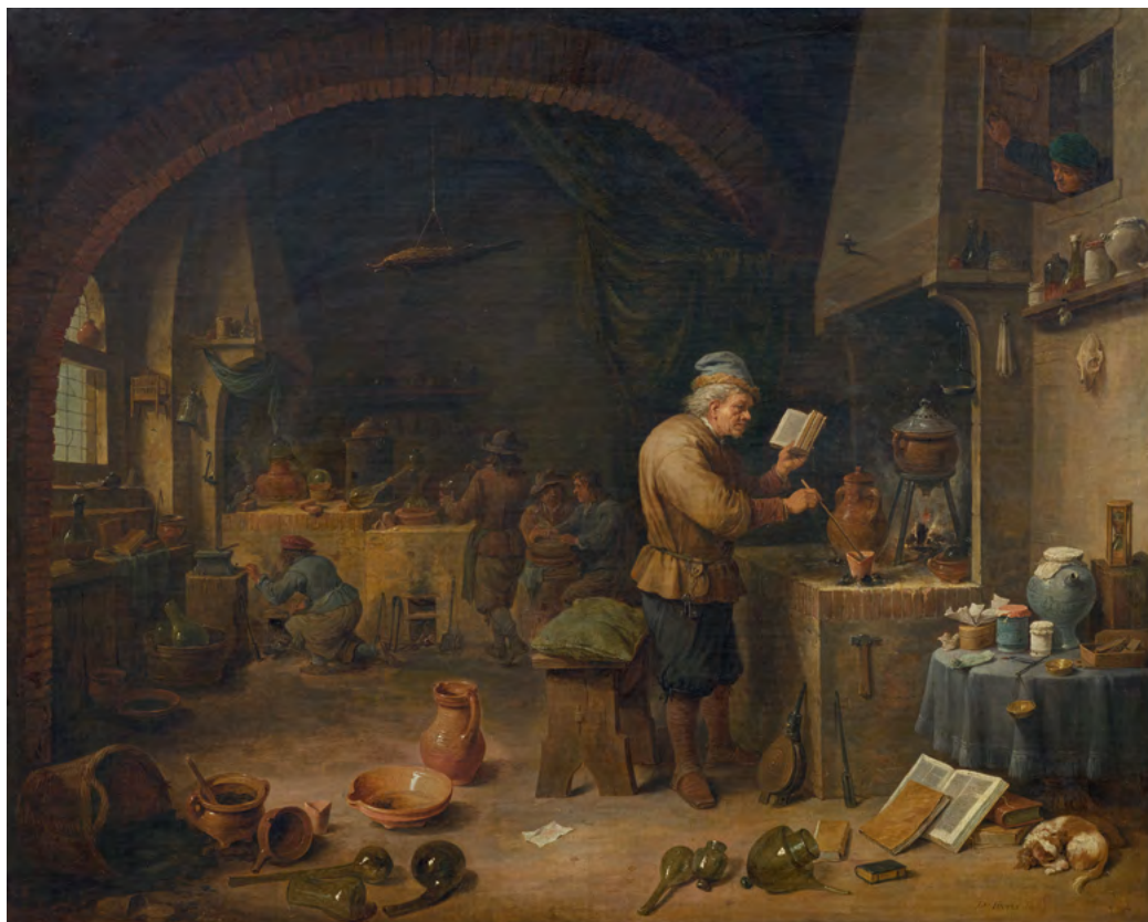
3032 DAVID TENIERS the Younger The Alchemist. Oil on canvas. 61 × 76.5 cm. Sold for CHF 256 000

The Old Master Drawings auction on 1 April enjoyed stellar results, with over 230% sold by value. A pencil and wash by Thomas Gainsborough after his 1773 painting 'Peasants returning from market' fetched CHF 85 000 (lot 3469).