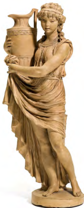
1245 CLAUDE MICHEL CLODION A young woman holding an amphora. Terracotta. H 44 cm. Sold for CHF 134 000