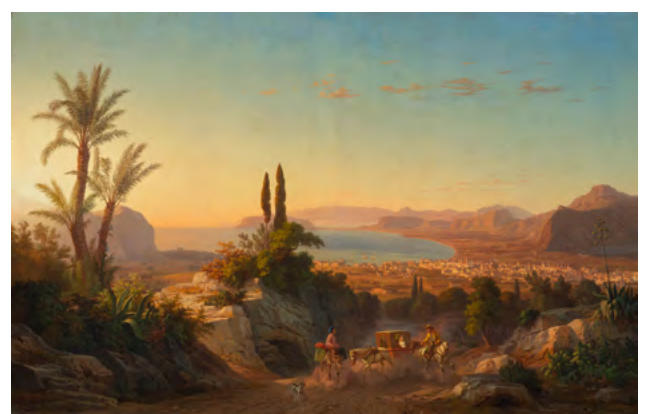
3238 CARL WILHELM GÖTZLOFF View of the Gulf of Palermo and Cap Zafferano with travelers. Oil on canvas. 85.5 × 133 cm. Sold for CHF 32 000