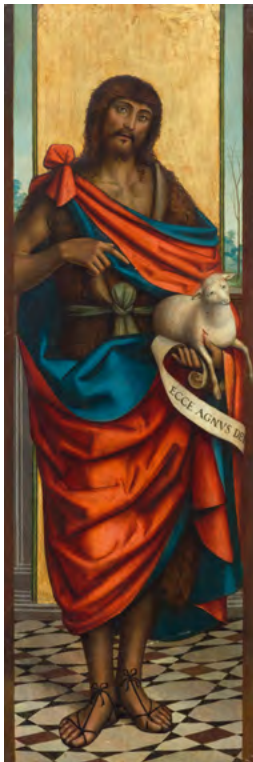
3010 DEFENDENTE FERRARI St. John the Baptist. Tempera on panel. 131 × 43.7 cm. Sold for CHF 73 000