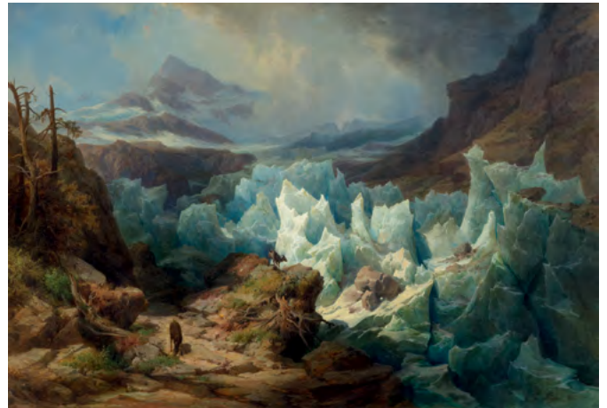
3207 EDUARD FRIEDRICH PAPE Chamois on the Grindelwald Glacier. 1848. Oil on canvas. 89 × 128 cm. Sold for CHF 33 000