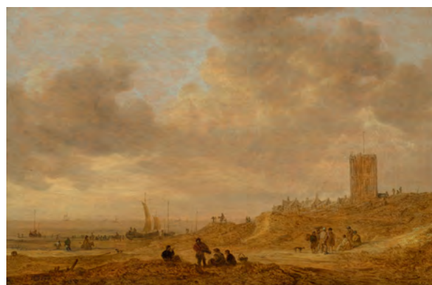
3029 JAN VAN GOYEN The seaside at Egmond aan Zee. 1644. Oil on panel. 39.2 × 60.8 cm. Sold for CHF 61 000