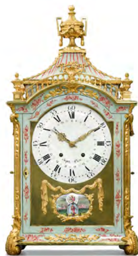
1233 THE EFFINGER CLOCK: A NEOCLASSICAL ORGAN CLOCK Louis XVI, Neuchâtel, La Chaux-de Fonds. Signed Pierre Jaquet-Droz. 46 × 32 × 89 cm Sold for CHF 266 000