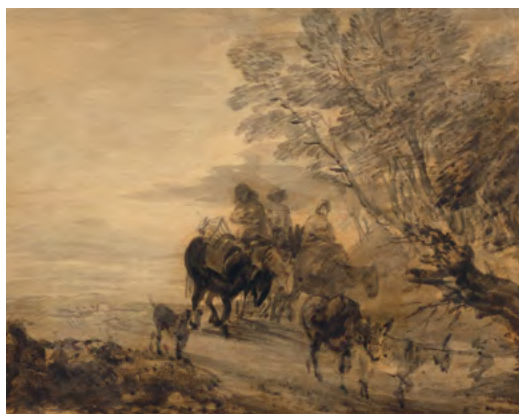
3469 THOMAS GAINSBOROUGH Peasants returning from market. 19.5 × 24.6 cm. Sold for CHF 85 000