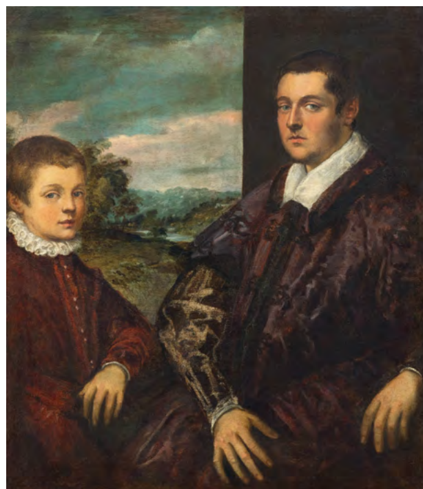
3021 DOMENICO TINTORETTO Portrait of a nobleman and a young man, probably brothers. Oil on canvas. 104 × 90 cm. Sold for CHF 78 000

The top lot in the Decorative Arts auction on 31 March was the 'Effinger' organ clock, of which the provenance could be traced back to its creation in 1783 by Pierre Jaquet-Droz. After spirited bidding, it was acquired by a Swiss museum (lot 1233, CHF 266 000).