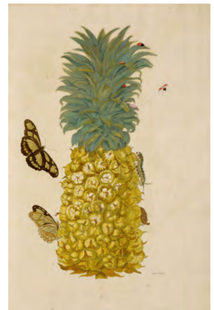
420 MARIA SYBILLA MERIAN Dissertatio de generatione et metamor- phosibus insectorum Surinamensium. The Hague, P. Gosse, 1726 Sold for CHF 110 000