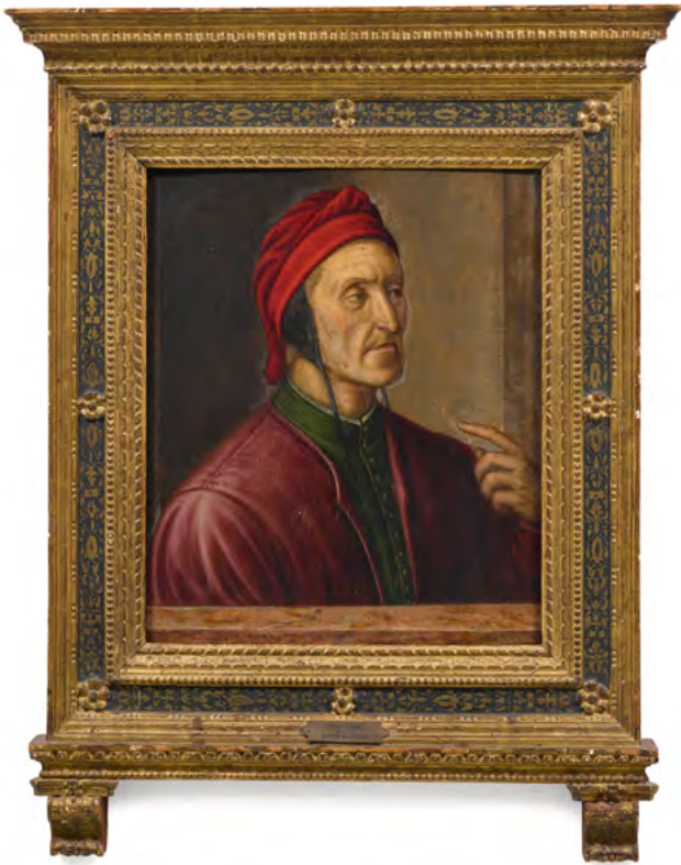
3011 16TH CENTURY FOLLOWER OF JACOPO CARUCCI CALLED PONTORMO Dante Alighieri. Oil on panel. 59.7 × 47.7 cm. Sold for CHF 59 000