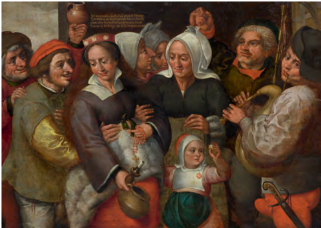
3018 MARTEN VAN CLEVE the Elder Before the wedding night. Oil on panel. 76 × 106 cm. Sold for CHF 43 000