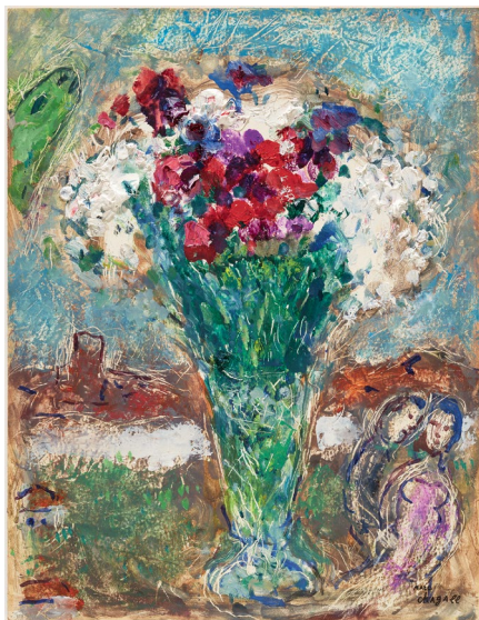
3267 MARC CHAGALL Grand bouquet à Vence. 1973. Oil and pastel on fibreboard. 35 × 27 cm. Estimate: CHF 300 000 / 400 000 Sold for CHF 354 100