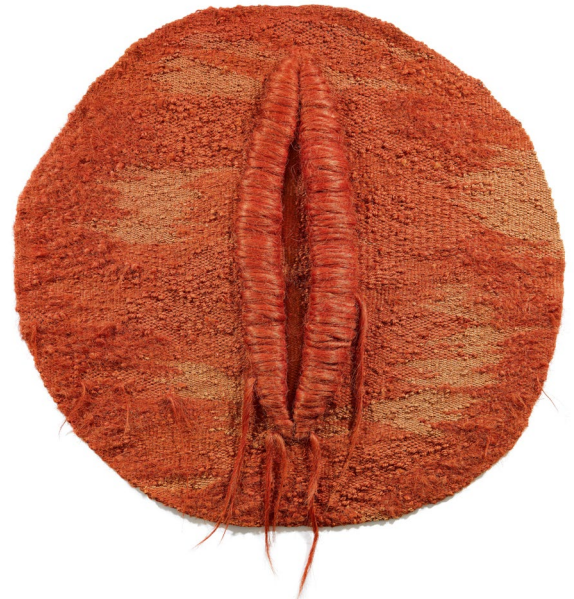
3439 MAGDALENA ABAKANOWICZ Cercle Coupé. 1972. Tapestry. Red sisal. 145 × 145 cm. Estimate: CHF 30 000 / 50 000 Sold for CHF 128 400