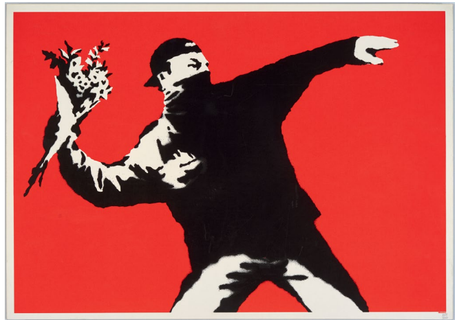
3717 BANKSY Love is in the air. 2003. Colour screenprint. 449/500. 49.3 × 69.3 cm. Estimate: CHF 30 000 / 50 000 Sold for CHF 67 400