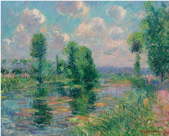
3208 GUSTAVE LOISEAU La Rivière (Eure). 1921. Oil on canvas. 66 × 81.9 cm. Estimate: CHF 150 000 / 250 000 Sold for CHF 354 100