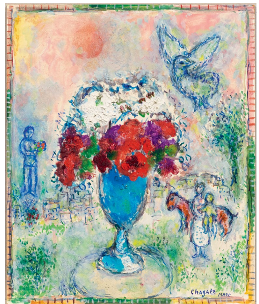
3222 MARC CHAGALL Le vase bleu. 1973. Oil and tempera on fibreboard. 45.9 × 37.9 cm. Estimate: CHF 150 000 / 250 000 Sold for CHF 603 000