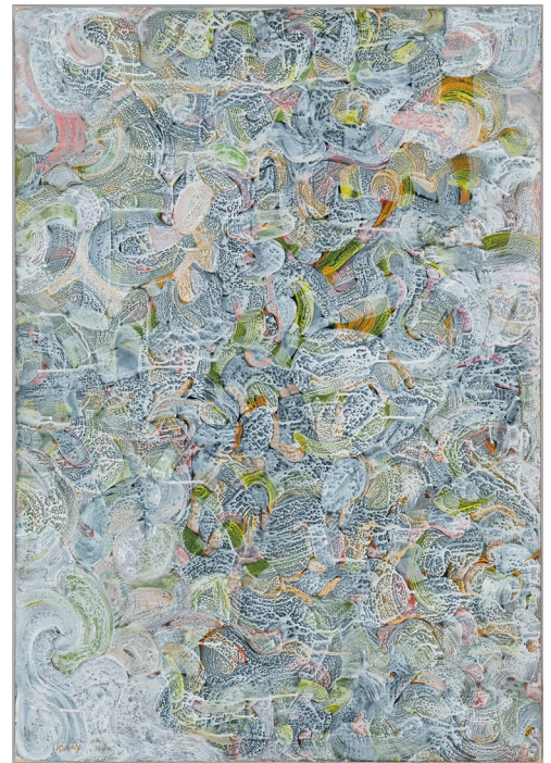
3413 MARK TOBEY Aquarium. 1964. Tempera on paper, laid down on strong cardboard. 100 × 69.5 cm. Estimate: CHF 130 000 / 180 000 Sold for CHF 274 800

Among the Swiss Art on 23 June, a view of the port of Honfleur by Félix Vallotton more than quadrupled its estimate at CHF 488 000 (lot 3028, CHF 100 000/150 000). Gottardo Segantini's homage to one of the most celebrated works by his father Giovanni, 'Ave Maria at the Crossing', sold for CHF 183 000 (lot 3024, CHF 150 000/250 000), and his Alpine landscape 'Agosto Alpestre' sold above the upper estimate at CHF 122 000 (lot 3047, est. CHF 60 000/120 000). Works by German/Swiss artist Clara Porges were in demand, for example a view of Lake Cavloccio near Maloja which more than doubled its estimate at CHF 85 700 (lot 3056, est. CHF 30 000/50 000). Alois Carigiet also was a sought-after name, and his 1974 portrait entitled Isidora also sold for CHF 85 700 against an estimate of CHF 30 000/50 000 (lot 3083).