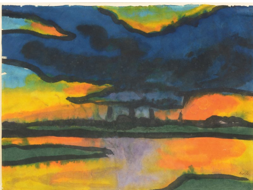
3247 EMIL NOLDE Abenddämmerung mit dunkler Wolke. Circa 1920. Watercolour and ink on Japan paper. 34.9 × 47.1 cm. Estimate: CHF 120 000 / 180 000 Sold for CHF 146 700