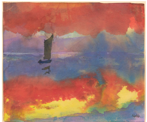
3240 EMIL NOLDE Meer mit Segelboot. 1946. Watercolour on Japan paper. 21.9 × 26 cm. Estimate: CHF 80 000 / 140 000 Sold for CHF 219 900