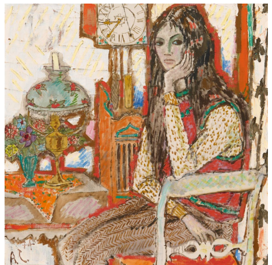
3083 ALOIS CARIGIET Isidora. 1974. Oil on canvas. 80 × 80 cm. Estimate: CHF 30 000 / 50 000 Sold for CHF 85 700