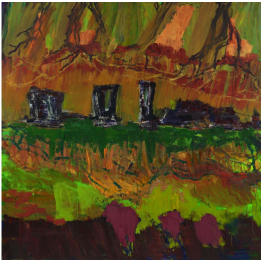
3457 PER KIRKEBY Fram Herbst. 2005. Oil on canvas. 200 × 200 cm. Estimate: CHF 80 000 / 140 000 Sold for CHF 158 900