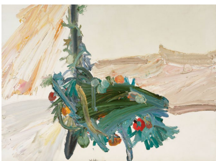
3424 MANOUCHER YEKTAI Untitled. 1963. Oil on canvas. 100 × 130 cm. Estimate: CHF 30 000 / 40 000 Sold for CHF 134 500