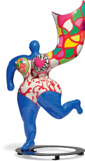
3700 NIKI DE SAINT PHALLE Angel vase. 1993. Multiple. Polychrome polyester resin, ceramic vase and iron base. 40/50. 100 × 41 × 55 cm (incl. base). Estimate: CHF 25 000 / 35 000 Sold for CHF 41 780