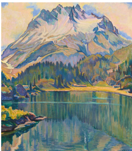
3056 CLARA PORGES Lägh da Cavloc with Pizzi dei Rossi, Maloja. Oil on canvas. 80.5 × 71 cm. Estimate: CHF 30 000 / 50 000 Sold for CHF 85 700