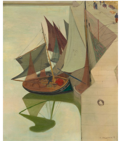
3028 FÉLIX VALLOTTON Bateaux à quai, Honfleur. 1913. Oil on canvas. 73 × 60 cm. Estimate: CHF 100 000 / 150 000 Sold for CHF 488 300