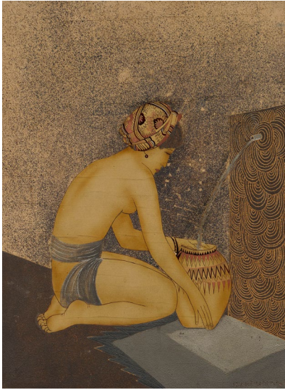
1023 JEAN DUNAND A lacquered wood panel, 'Femme au turban agenouillée devant une fontaine', circa 1925–1930. 60 × 50 cm. Estimate: CHF 40 000 / 60 000 Sold for CHF 140 300