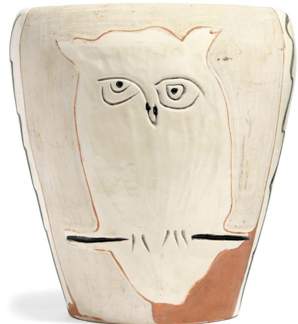
3657 PABLO PICASSO Visage et hibou. 1958. Vase. Painted ceramic. 17/200. H 26 cm. Estimate: CHF 15 000 / 25 000 Sold for CHF 39 340