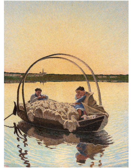
3024 GOTTARDO SEGANTINI Ave Maria at the crossing. 1952. Oil on fibreboard. 108.5 × 82.5 cm. Estimate: CHF 150 000 / 250 000 Sold for CHF 183 300