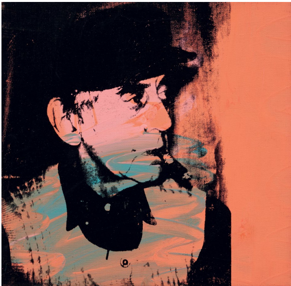
3430 ANDY WARHOL Man Ray. 1974. Acrylic and colour screenprint on canvas. 32.9 × 33 cm. Estimate: CHF 100 000 / 150 000 Sold for CHF 146 700