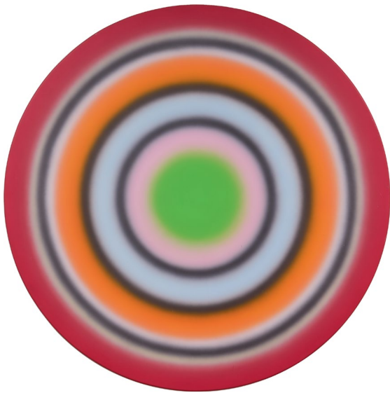
3452 UGO RONDINONE Siebter Januar neunzehnhundertachtundneunzig. 1998. Acrylic airbrush on canvas and screenprint on plexiglass. D 220 cm. Estimate: CHF 100 000 / 200 000 Sold for CHF 183 300