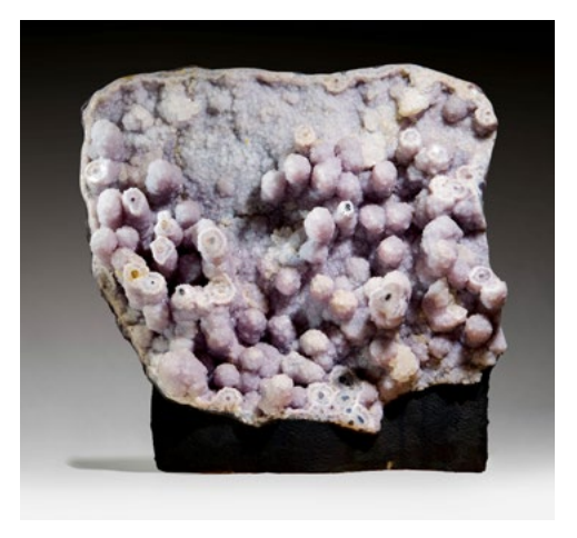
LOT 863 - AMETHYST STALACTITE GEODE Santa Catarina, Brazil 106 × 112 × 45 cm. 416 kg. ESTIMATE: CHF 38 000 / 60 000