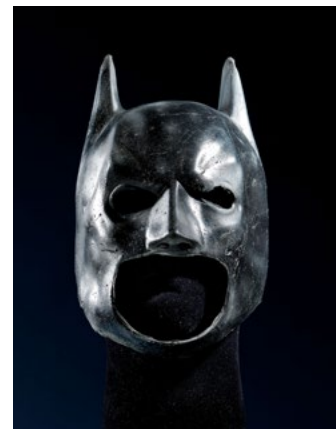
LOT 902 - ORIGINAL BATMAN TEST MASK 'The Dark Knight', 2008 23 × 23 × 14 cm (not including stand) ESTIMATE: CHF 2 000 / 4 000

LOT 879 - APOLLO 13 MICROFILM BIBLE FROM THE