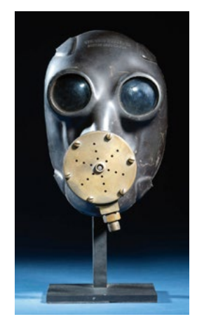
LOT 837 — ANTIQUE DIVING MASK USA, 1940 22 × 14 × 15 cm (not including stand) ESTIMATE: CHF 3 500 / 5 000