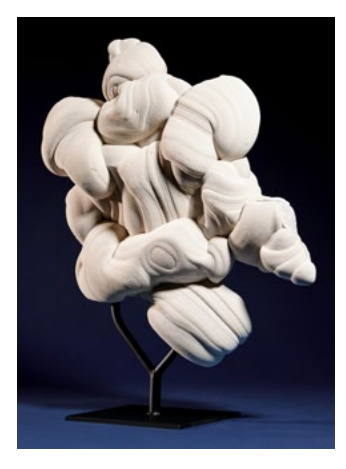
LOT 894 — 'PROMETHEUS' GOGOTTE Fontainebleau, France 61 × 49 × 19 cm (not including stand) ESTIMATE: CHF 8 000 / 12 000