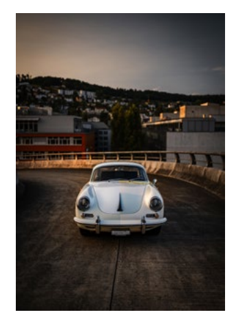
LOT 831 — PORSCHE 356SC PAINTED BY ALFREDO HÄBERLI Project 'Weight of Lightness' 356 SC 1600 Karmann Coupé, 1964 ESTIMATE: CHF 95 000 / 180 000