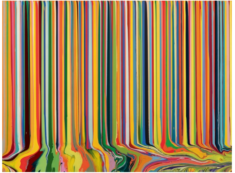
3433 IAN DAVENPORT Colourcade: Orange and Yellow. 2015. Acrylic on stainless steel, on aluminium. 150 × 200 cm (2 parts). CHF 60 000 / 80 000

Over 400 lots will be offered in the Jewellery auction on 29 November, including several unmounted stones that of outstanding quality and size, such as a Paraiba tourmaline of over 22 ct. (lot 2347, CHF 280 000 / 380 000), and a cabochon emerald of an impressive 176.24 ct. (lot 2133, CHF 250 000 / 350 000). The Watches auction on 27 November features a Patek Philippe platinum men's wristwatch from 1944 that may well be the only one of its kind ever made (lot 2861, CHF 120 000 / 180 000). And for the first time, Koller will offer a private Swiss collection of luxury writing instruments in a special sale entitled ' Fountain Pen Fascination '. Among the over 200 lots in the 27 November auction are rare examples from Dunhill-Namiki (lot 1185, CHF 20 000 / 30 000) and Montblanc (lot 1132, CHF 30 000 / 50 000).