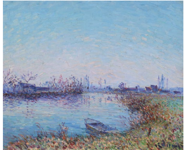
3206 GUSTAVE LOISEAU Impression de gelée, le matin au soleil levant, Tournedos-sur-Seine. Circa 1899. Oil on canvas 54.5 × 65 cm. CHF 100 000 / 150 000