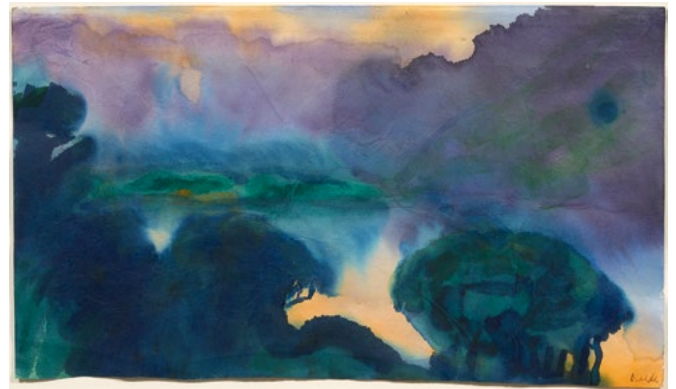
3226 EMIL NOLDE Gebirgssee/Bergsee (Mountain lake). 1948. Watercolour on Japan paper. 26.5 × 45.6 cm. CHF 80 000 / 120 000