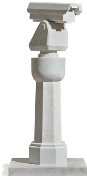
3465 AI WEIWEI Surveillance Camera and Plinth. 2015. Marble. 15/17. 118 × 51.5 × 52 cm. CHF 150 000 / 250 000