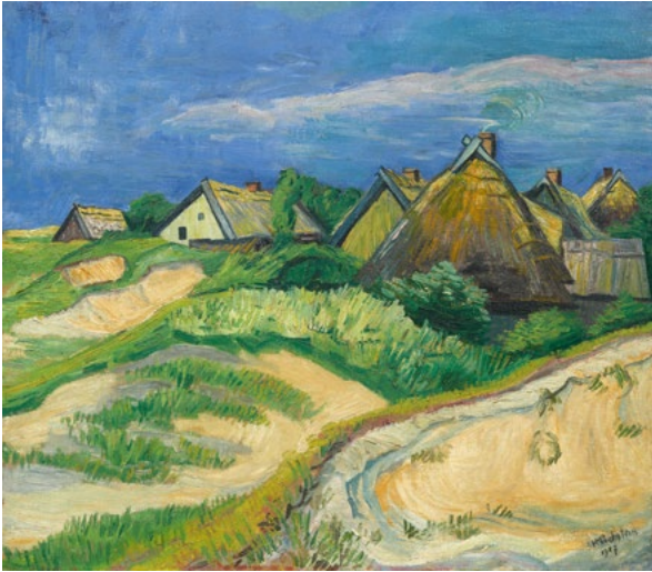
3235 HERMANN MAX PECHSTEIN Landscape (houses in dunes). 1927. Oil on canvas. 70.5 × 80.5 cm. CHF 100 000 / 150 000