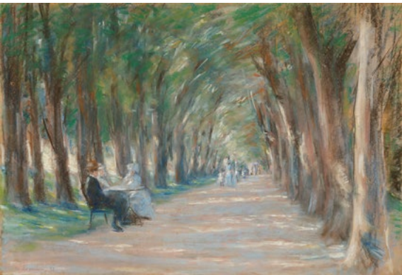
3203 MAX LIEBERMANN Allee in Schlangenbad (Promenade in Schlangenbad). 1895. Pastel on board. 60.5 × 88 cm. CHF 60 000 / 80 000