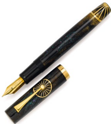
1185 DUNHILL-NAMIKI Motorities Emperor Maki-e Limited Edition 25. 18kt gold nib. Numbered 12/25. CHF 20 000 / 30 000

And the third edition of ' Out of This World ' on 4 December will include the impressive skull of a juvenile Triceratops (lot 873, CHF 300 000 / 500 000). For more information about this auction, please see the separate press release