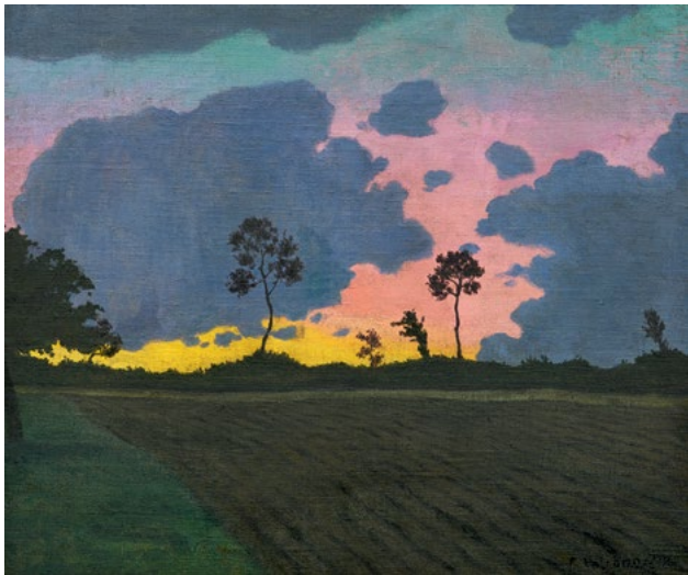
3029 FÉLIX VALLOTTON Coucher de soleil, nuages bleus. 1918. Oil on canvas. 46 × 54 cm. CHF 750 000 / 1 000 000