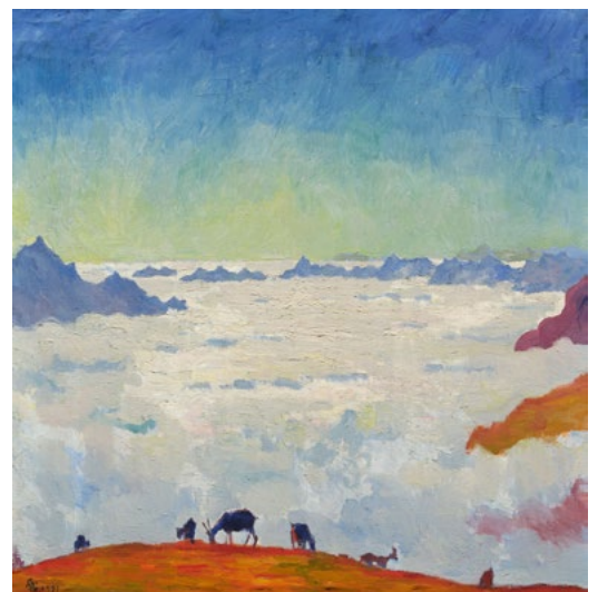
3019 GIOVANNI GIACOMETTI Mare di Nebbia. 1921. Oil on canvas. 87 × 90 cm. CHF 250 000 / 350 000