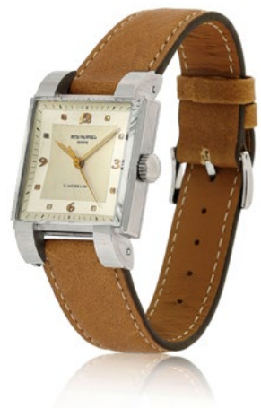
2861 PATEK PHILIPPE The only known ref. 1599 - possibly unique, 1944. 950 platinum. CHF 120 000 / 180 000