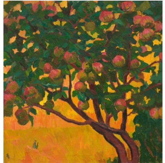
3032 GIOVANNI GIACOMETTI The apple tree. 1912. Oil on canvas. 81.5 × 81 cm CHF 250 000 / 400 000

The PostWar & Contemporary Art auction on 30 November includes a marble sculpture of a surveillance camera by Chinese dissident artist Ai Weiwei , which underlines the tension between technology and personal freedom (lot 3465, CHF 150 000 / 250 000 ). A monumental work by Jannis Kounellis is part of the artist's explorations of representing our world through non-traditional artistic means (lot 3428, CHF 180 000 / 280 000 ). Works by Mark Tobey (lot 3420, CHF 160 000 / 240 000 ), Jesús Rafael Soto (lot 3431, CHF 100 000 / 200 000 ), Victor Vasarely (lot 3408, CHF 70 000 / 90 000 ) and Ian Davenport (lot 3433, CHF 60 000 / 80 000 ) round out the contemporary art on offer.