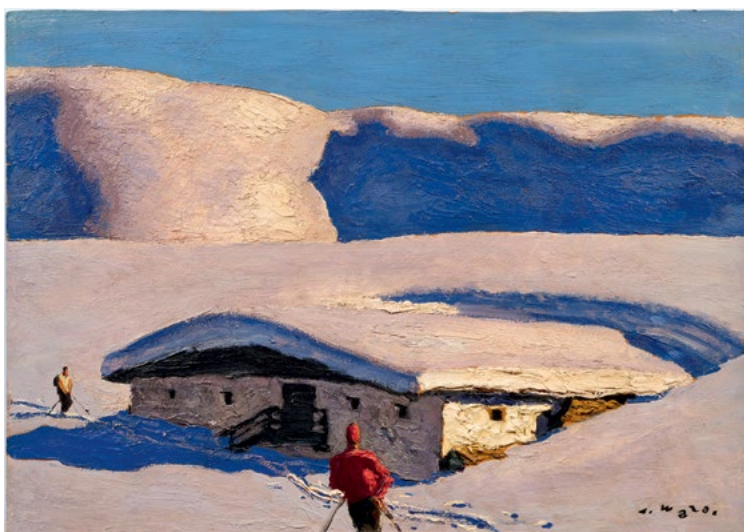
3241 ALFONS WALDE Skiers in an Alpine pasture. 1933. Oil on board. 42 × 59 cm. CHF 250 000 / 350 000

The PostWar & Contemporary Art auction on 30 November includes a marble sculpture of a surveillance camera by Chinese dissident artist Ai Weiwei , which underlines the tension between technology and personal freedom (lot 3465, CHF 150 000 / 250 000 ). A monumental work by Jannis Kounellis is part of the artist's explorations of representing our world through non-traditional artistic means (lot 3428, CHF 180 000 / 280 000 ). Works by Mark Tobey (lot 3420, CHF 160 000 / 240 000 ), Jesús Rafael Soto (lot 3431, CHF 100 000 / 200 000 ), Victor Vasarely (lot 3408, CHF 70 000 / 90 000 ) and Ian Davenport (lot 3433, CHF 60 000 / 80 000 ) round out the contemporary art on offer.