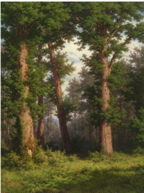
3008 ROBERT ZÜND Oak forest. Oil on canvas 80 × 60 cm. CHF 150 000 / 250 000