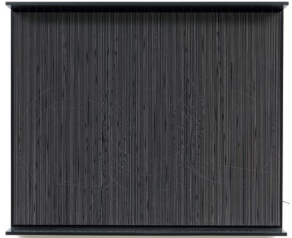
3431 JESÚS RAFAEL SOTO Trois cercles noirs. 1996. Painted wood, wire, metal and colour screenprint. 85.5 × 102 × 16.5 cm. CHF 100 000 / 200 000