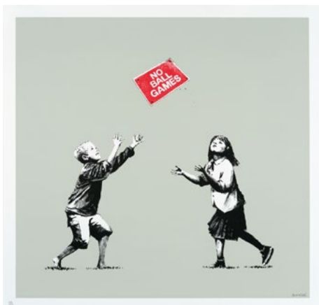
3684 BANKSY No Ball Games (Grey). 2009. Colour screenprint. 233/250. 67 × 70 cm. CHF 35 000 / 45 000