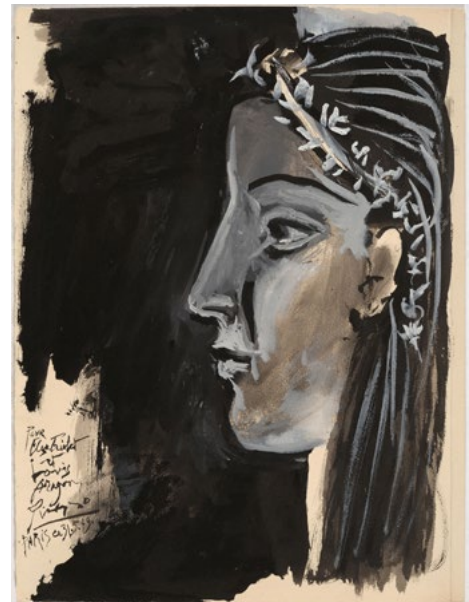
3217 PABLO PICASSO Portrait of Françoise Gilot. 1949. Ink and watercolour on paper. 38 × 28.5 cm. CHF 180 000 / 280 000