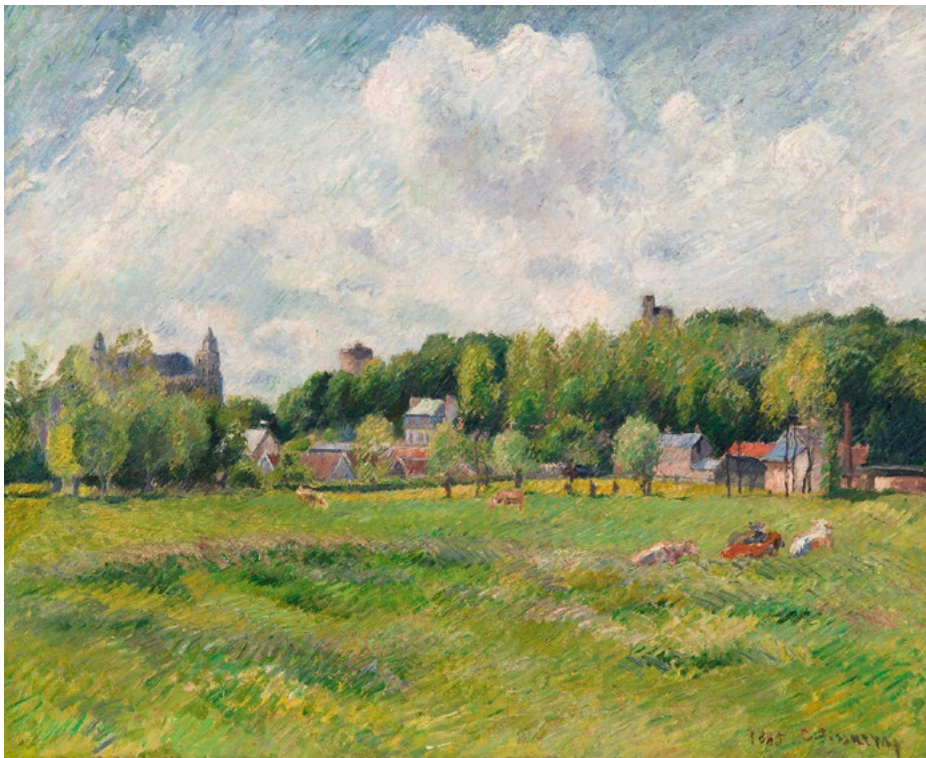
3211 CAMILLE PISSARRO Prairies à Gisors. 1885. Oil on canvas. 59.7 × 73 cm. CHF 1.1 / 1.6 million

Catalogue online: www.kollerauctions.com