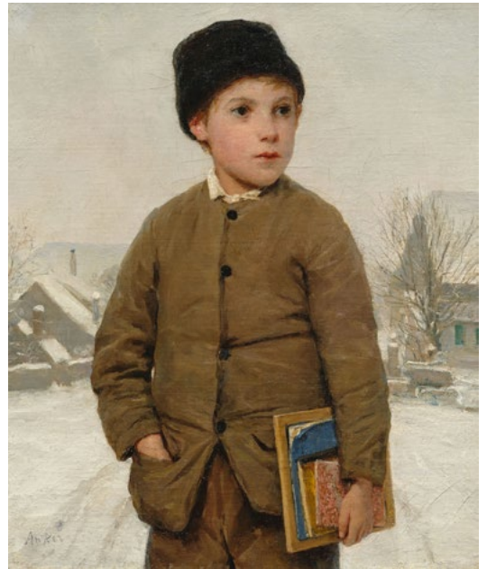
3014 ALBERT ANKER School child with a fur hat in a snowy landscape. 1877. Oil on canvas. 38 × 32.5 cm. CHF 350 000 / 650 000