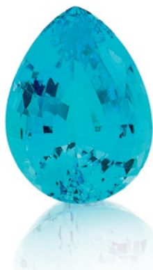
2347 UNMOUNTED PARAÍBA TOURMALINE Very fine blue pear-shaped Paraiba tourmaline of 22.14 ct, Mozambique. CHF 280 000 / 380 000