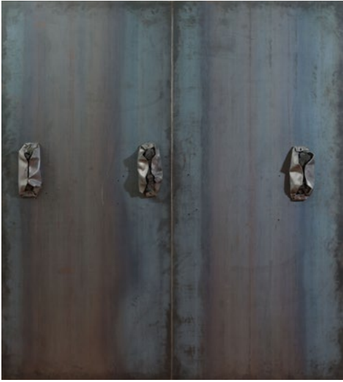
3428 JANNIS KOUNELLIS Untitled. 1989. Charcoal and lead on iron. 201 × 181 × 14 cm. CHF 180 000 / 280 000