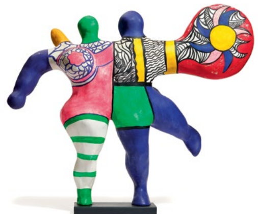
3447 NIKI DE SAINT PHALLE Les patineurs (couple ailé). Painted resin. Unique piece. 49 × 65 cm. CHF 25 000 / 35 000 Sold for CHF 107 000