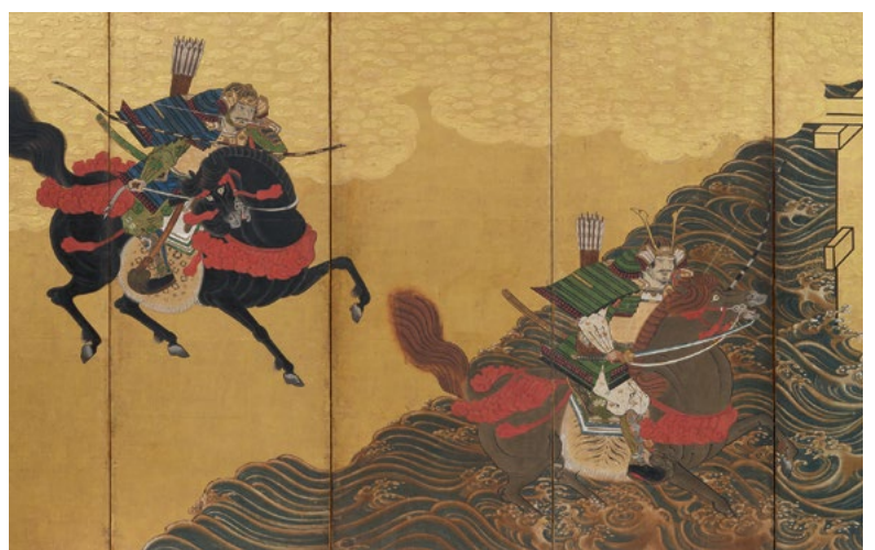
376 A MAGNIFICENT PAIR OF HASEGAWA SCHOOL STANDING SCREENS Japan, early 17th century Ink, colours and gold as well as gold leaf on paper. 169.7 × 376 cm each. CHF 80 000 / 120 000 Sold for CHF 150 000