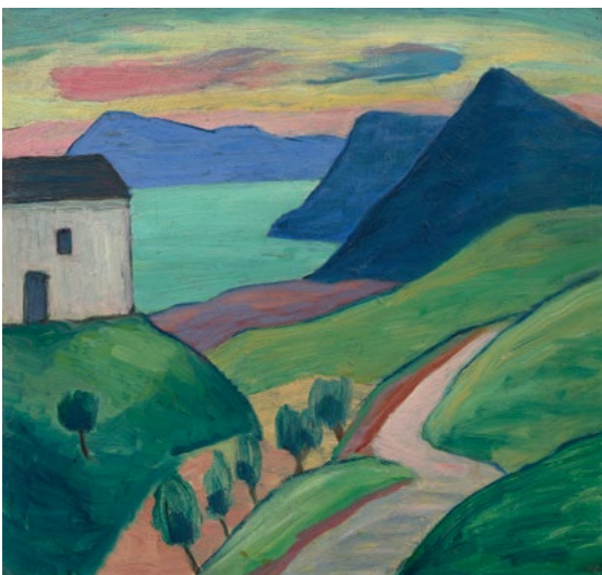
3247 GABRIELE MÜNTER Haus am See mit blauen Bergen. 1933–35. Oil on board. 38 × 40 cm. CHF 200 000 / 300 000 Sold for CHF 250 000

The top lot in the Asian Art auction on 18 June was a work by the highly sought-after Chinese artist Lin Fengmian , which sold well above its estimate at CHF 375 000 (lot 251, estimate CHF 180 000 / 250 000). Although the owner was sad to see the painting leave his collection, he can't complain about the result: he saw the work years ago at a flea market , and although he knew nothing about the artist, fell in love with it and purchased it ... for CHF 400. A pair of Hasegawa school standing screens were acquired at the auction by the prestigious Rietberg Museum in Zurich for CHF 150 000 (lot 376, estimate CHF 80 000 / 120 000).