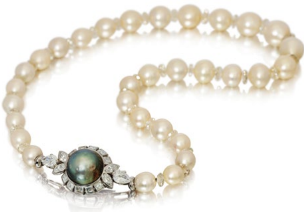
2314 NATURAL PEARL AND DIAMOND NECKLACE, PROBABLY BY CARTIER. London, circa 1920. CHF 70 000 / 100 000 Sold for CHF 400 000

The Jewellery auction on 19 June was once again very successful, with hammer prices totalling 97% of the lower estimates , including a beautiful natural pearl and diamond necklace attributed to Cartier that fetched CHF 400 000 against an estimate of CHF 70 000 / 100 000 (lot 2314). In the Watches auction on 17 June, an early Patek Philippe perpetual calendar watch changed hands for CHF 500 000 (lot 2885, CHF 180 000 / 360 000).