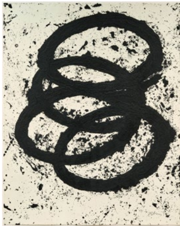
3696 RICHARD SERRA T.E. Siegen. 1999. Etching. 29/40. 151.1 × 121 cm. CHF 18 000 / 28 000 Sold for CHF 67 000