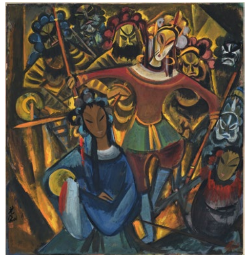
251 LIN FENGMIAN Sun Wukong and his opera retinue in the play 'Uphear in Heaven'. Ink and colours on paper. 69 × 65 cm. CHF 180 000 / 250 000 Sold for CHF 375 000