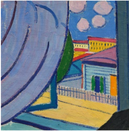
3239 ALEXANDER KONSTANTINOVICH BOGOMAZOV View from the window. 1913. Oil on canvas. 34 × 34 cm. CHF 60 000 / 90 000 Sold for CHF 143 000