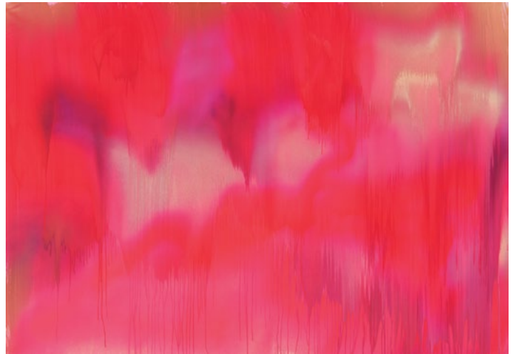
3451 KATHARINA GROSSE Untitled. 2000. Acrylic on canvas. 200 × 284 cm. CHF 180 000 / 250 000 Sold for CHF 225 000

In the Impressionist and Modern Art auction on 21 June, works by early 20th-century woman artists were in demand, such as an autumnal landscape with riders by Marianne von Werefkin that sold for a world auction record CHF 475 000 (lot 3235, estimate CHF 100 000 / 150 000), and Gabriele Münter's 'House on the lake with blue mountains' from 1933–35 that changed owners for CHF 250 000 (lot 3247, estimate CHF 120 000 / 200 000).