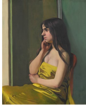
3041 FÉLIX VALLOTTON Torse à l'étoffe jaune. 1913. Oil on canvas. 81 × 65.5 cm CHF 100 000 / 150 000 Sold for CHF 225 000