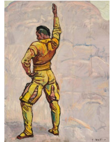
3047 FERDINAND HODLER Unanimity, Oath taker. 1913. Oil on canvas. 88 × 64.5 cm. CHF 100 000 / 150 000 Sold for CHF 237 000