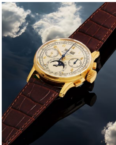
2885 PATEK PHILIPPE Perpetual calendar with chronograph Ref. 1518, 1950. 18K yellow gold. CHF 180 000 / 360 000 Sold for CHF 500 000