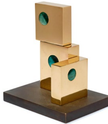
3292 BARBARA HEPWORTH Three forms (Extra eye). 1969. Polished bronze. H 20 cm. CHF 60 000 / 80 000 Sold for CHF 168 000