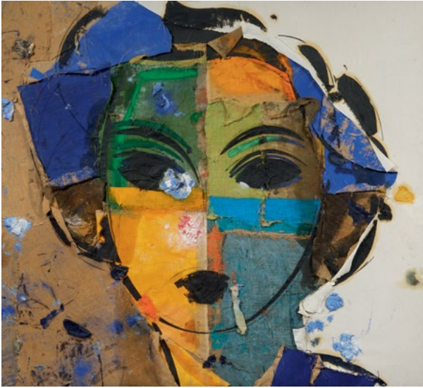
3443 MANOLO VALDÉS Dorothy IX. 2003. Oil, paper, tar and jute collaged with yarn and staples, on jute. 180 × 300 cm. CHF 180 000 / 300 000 Sold for CHF 350 000