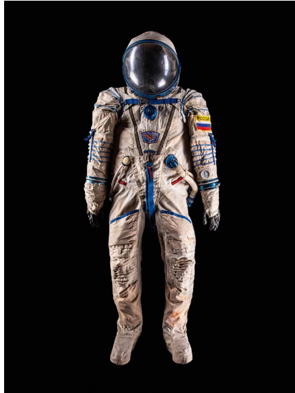
911 SOKOL-KV2 SPACE SUIT Manufactured by NPP Zvezda 1985 165 × 70 × 40 cm CHF 65 000 / 85 000