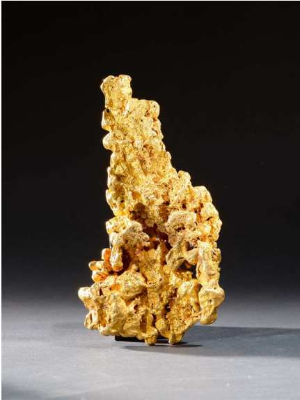
935 GOLD NUGGET Victoria, Australia 1 647 g 16.8 × 8.8 cm CHF 120 000 / 150 000