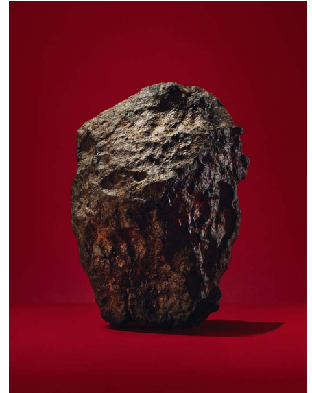
942 THE RED COLOSSUS MARTIAN METEORITE Official meteorite name: Swayyah 005 2 145 g, 16.6 × 11.5 × 9.3 cm CHF 150 000 / 250 000